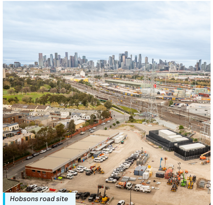
Hobsons road site

24 hour works are sometimes required during peak construction activities We will notify if out of hours works are required