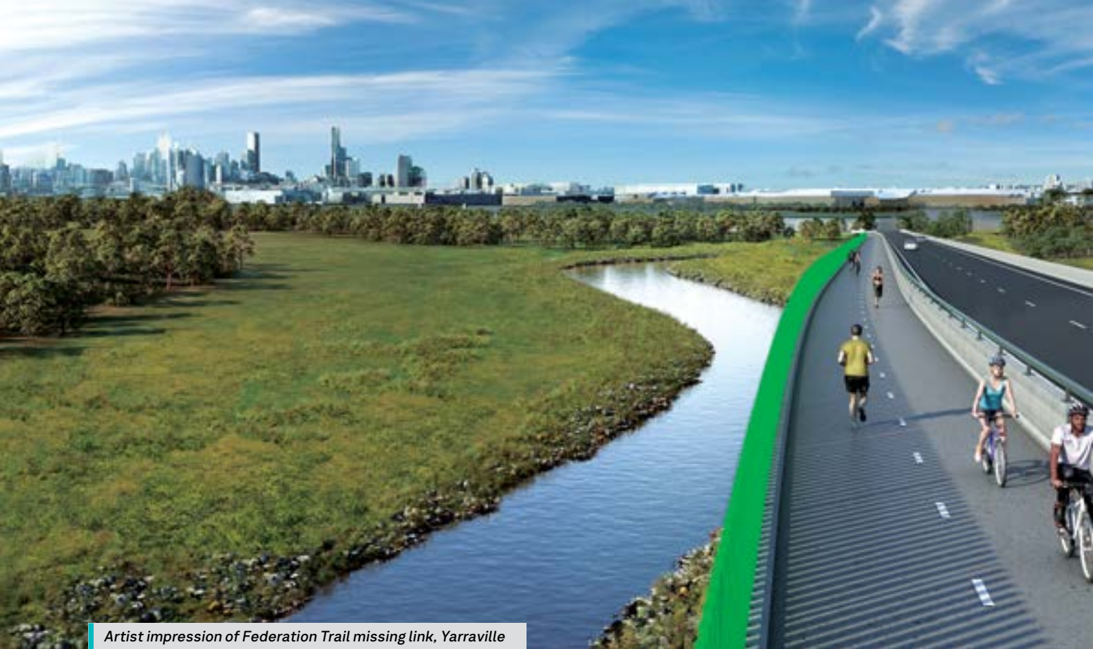
Artist impression of Federation Trail missing link, Yarraville