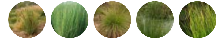
Tall Rush Green Rush Tall Sedge Rush Sedge Soft Twig-sedge