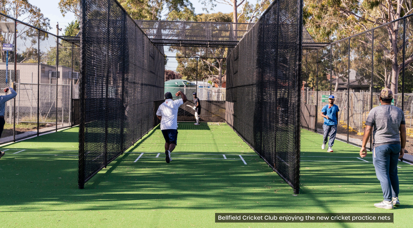
Bellfield Cricket Club enjoying the new cricket practice nets

"We are excited because these facilities will help us in building a stronger club that can serve the community."