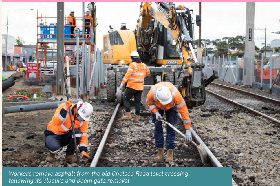
Workers remove asphalt from the old Chelsea Road level crossing following its closure and boom gate removal