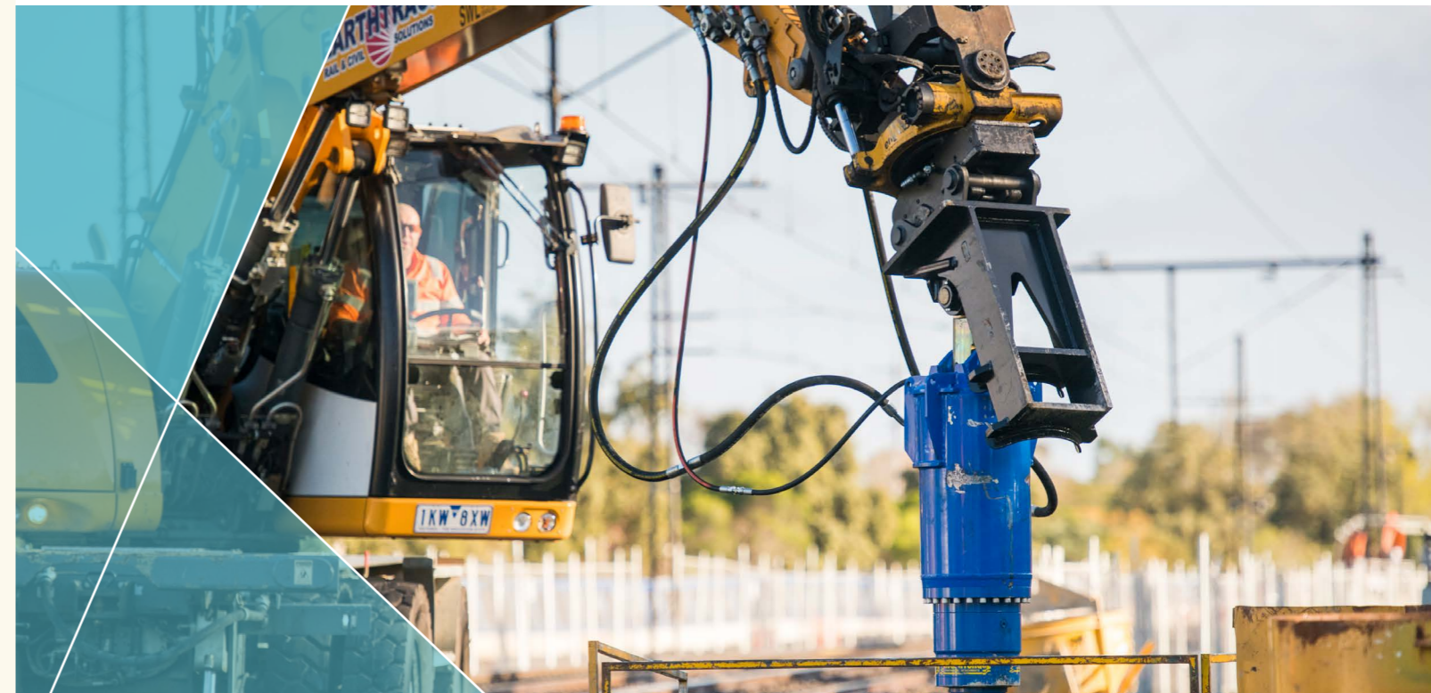
Preparation works continue for the upcoming construction blitz

We're removing the dangerous Ferguson Street level crossing in Williamstown by lowering the rail line beneath the road, making way for a new North Williamstown Station and an upgraded precinct for the community to enjoy.