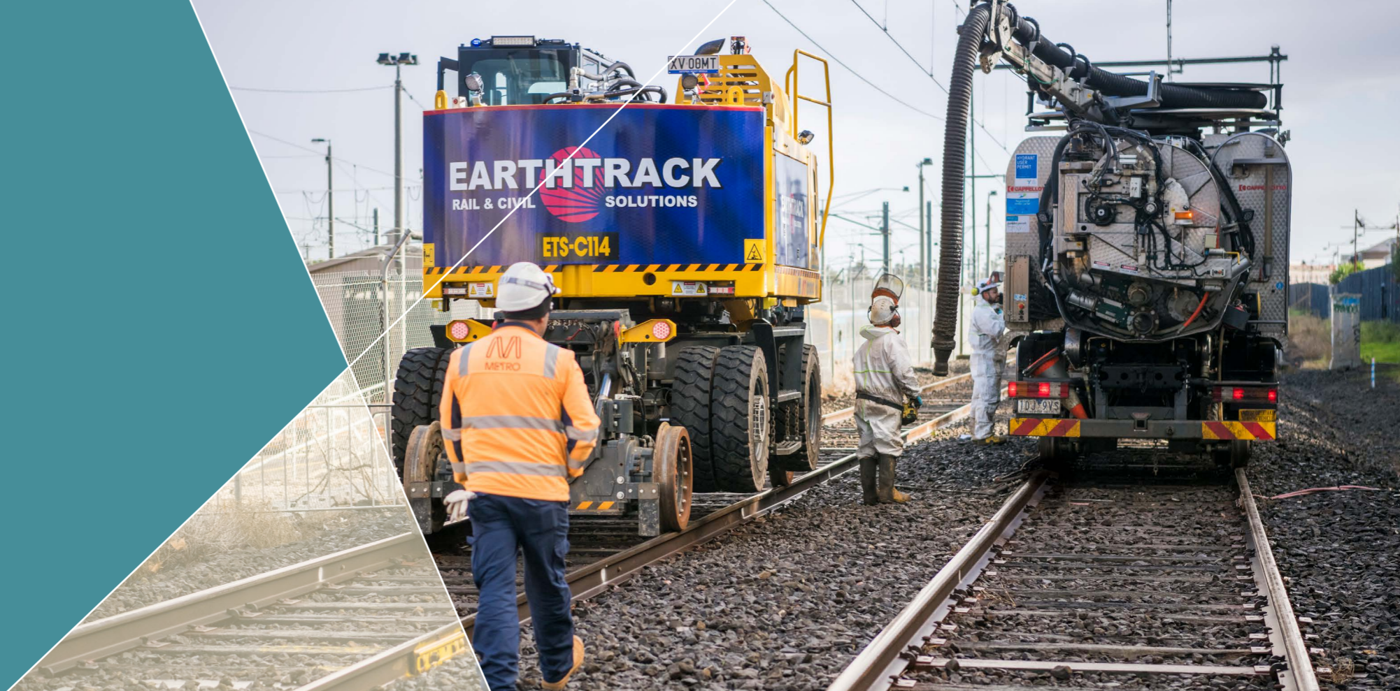
Working along the rail corridor

Build a new North Williamstown Station, with stairs and lifts to lowered platforms.