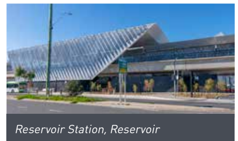
Reservoir Station, Reservoir

Works are now underway to remove the level crossings at Oakover Road, Bell Street, Cramer Street and Murray Road in Preston. This means that Bell Street will be level crossing-free. We're also building the new Preston and Bell Stations.