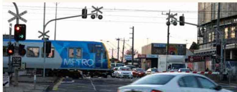
Keon Parade, Keon Park

* Further engineering assessments and community engagement will be undertaken on these projects.