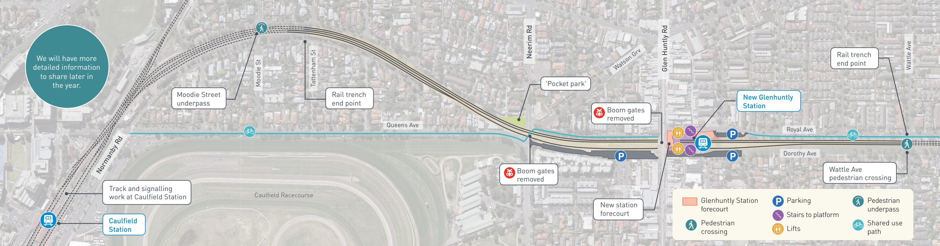
High level plan of Glen Huntly works area

We will have more detailed information to share later in the year.