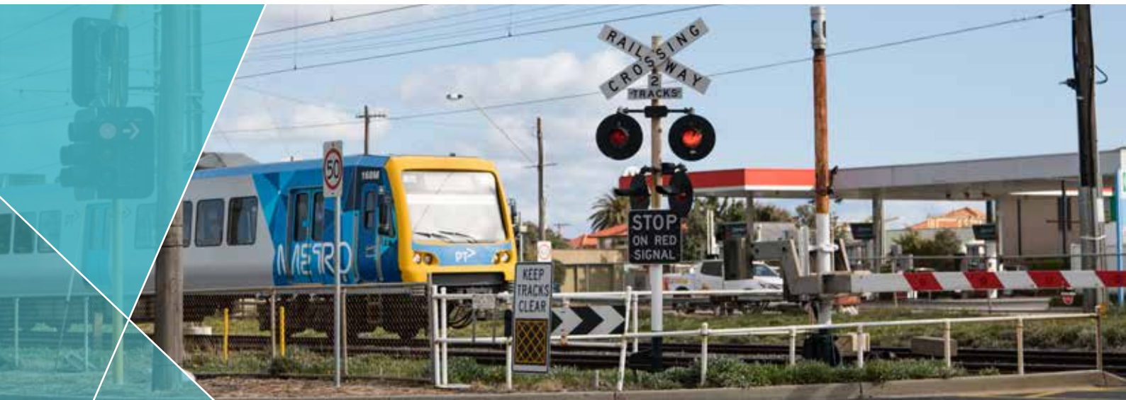
Argyle Avenue, Chelsea.