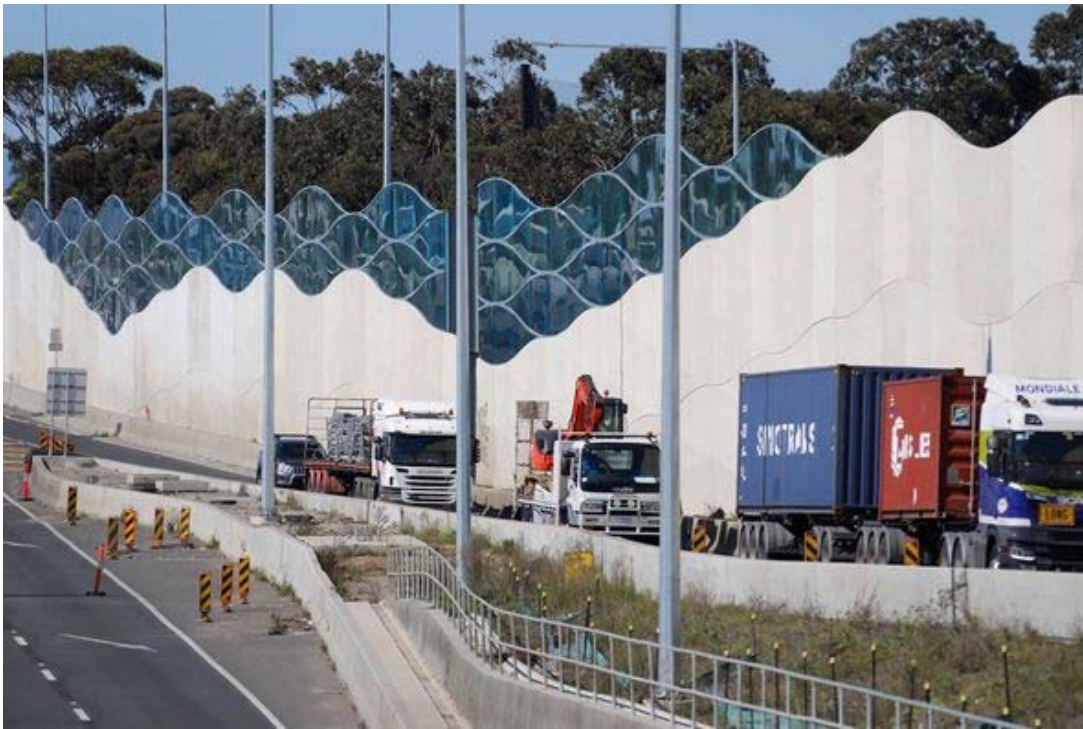
Looking southeast at the Grieve Pde Exit Ramp (known as G2)