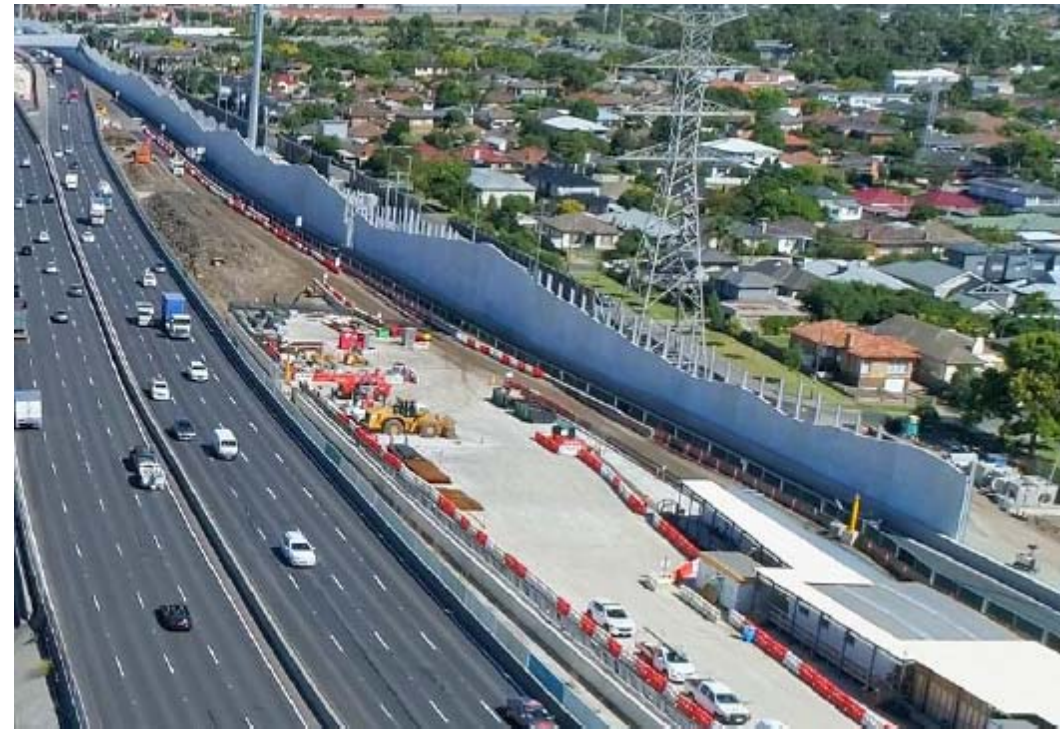
Looking northwest at the Inbound Southern Tunnel Portal and Williamstown Rd Inbound Exit Ramp (known as W1)