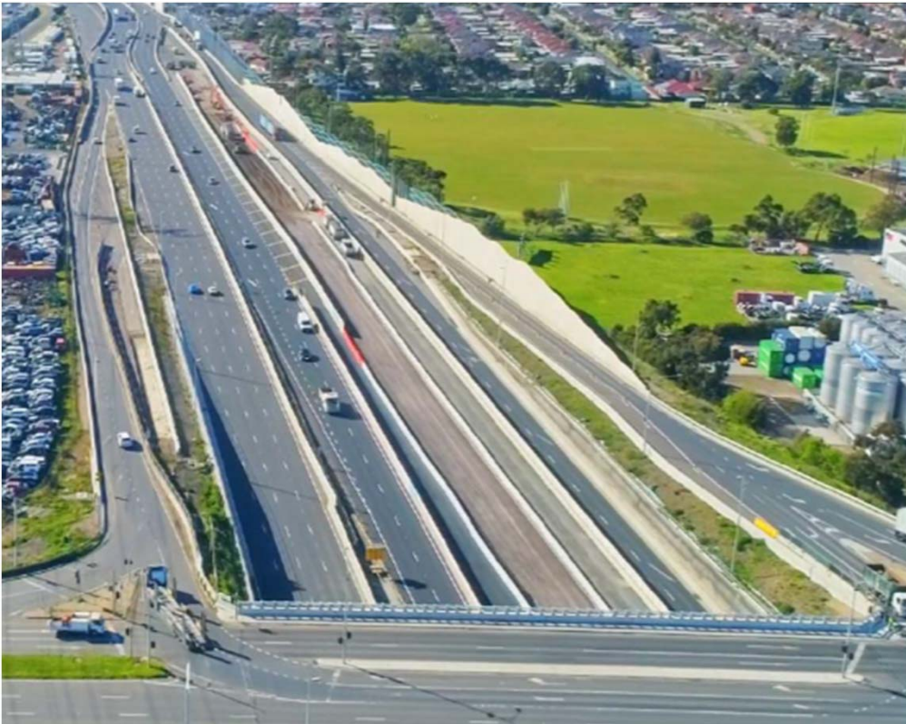
Grieve Parade August 2021