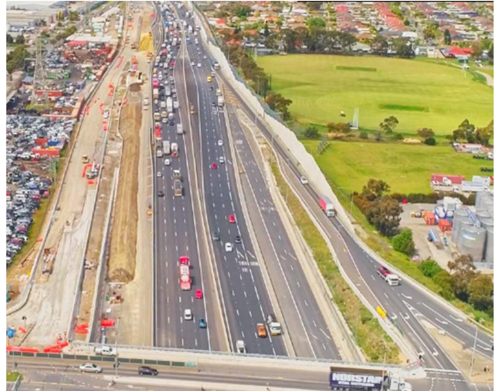
Grieve Parade October 2021