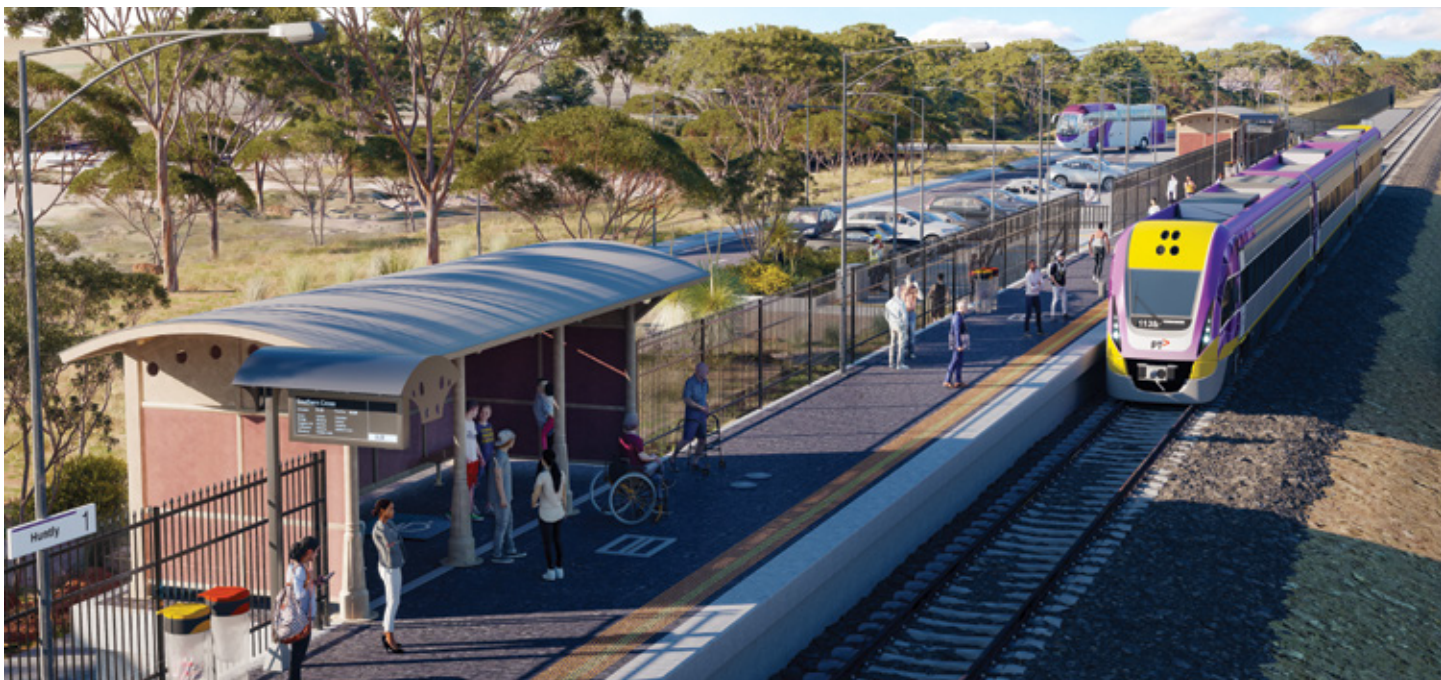
Concept image — Huntly Station

Lighting and CCTV will provide station users with added security.