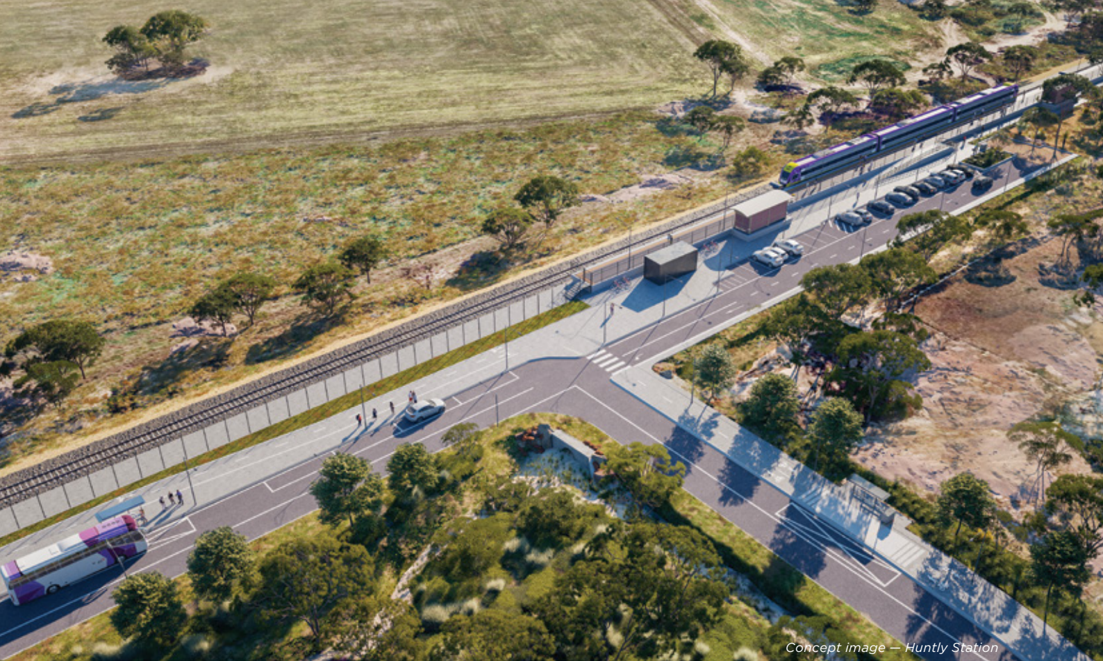
Concept image — Huntly Station