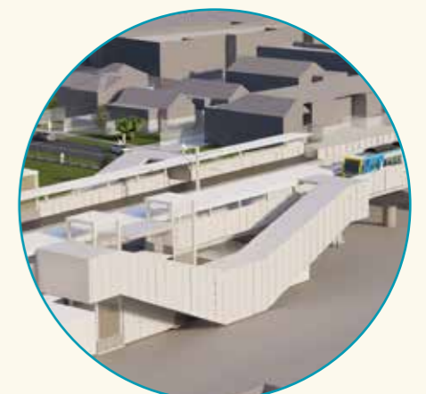
Artist impression - subject to change.

For more information about the project, visit levelcrossings.vic.gov.au/projects