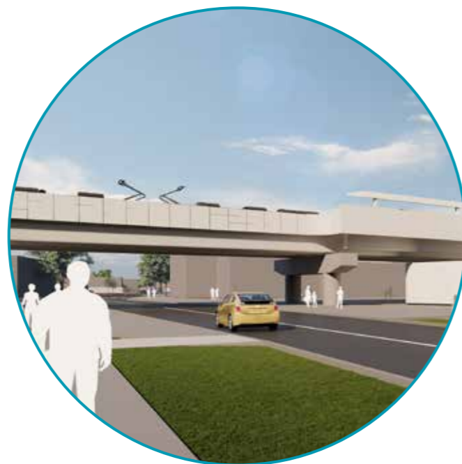
The design solution for the Webb Street, Narre Warren level crossing. Artist impression - subject to change.

Drainage is an important part of railway infrastructure design. That's especially true for Narre Warren, which has a high water table and can be prone to flooding. We have expert hydrologists working as part of the team to ensure local flooding, drainage and run-off issues are considered.