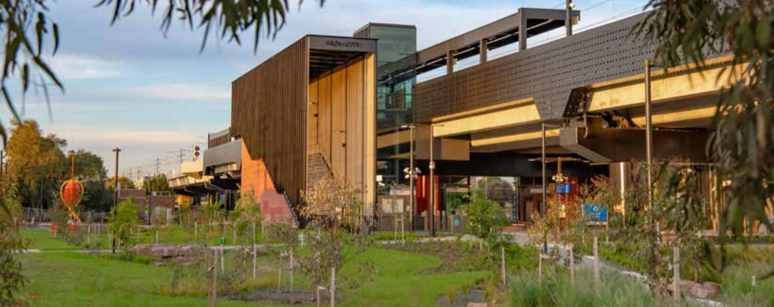
Moreland Station and open space