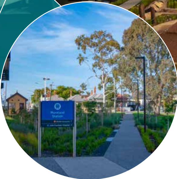
New open space near Moreland Station