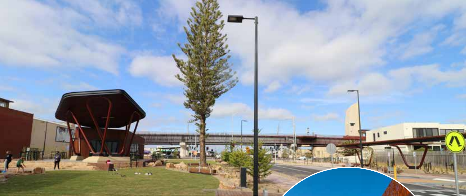
Carrum open space