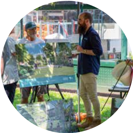
Engagement at Mentone Garden Event, January 2020

A community consultation report will be available online April-May 2022, including all of the feedback we receive about the new open space.