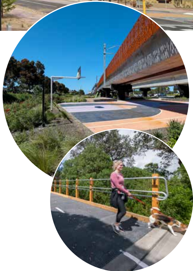
Hawkstowe open space and elevated rail (above) Seaford walking and cycling path (below)

Opportunities for this new open space include new trees and landscaping, walking and cycling paths, playgrounds, recreation areas, sporting facilities, and more parking for the local shops, which will encourage more people to the shopping precinct.