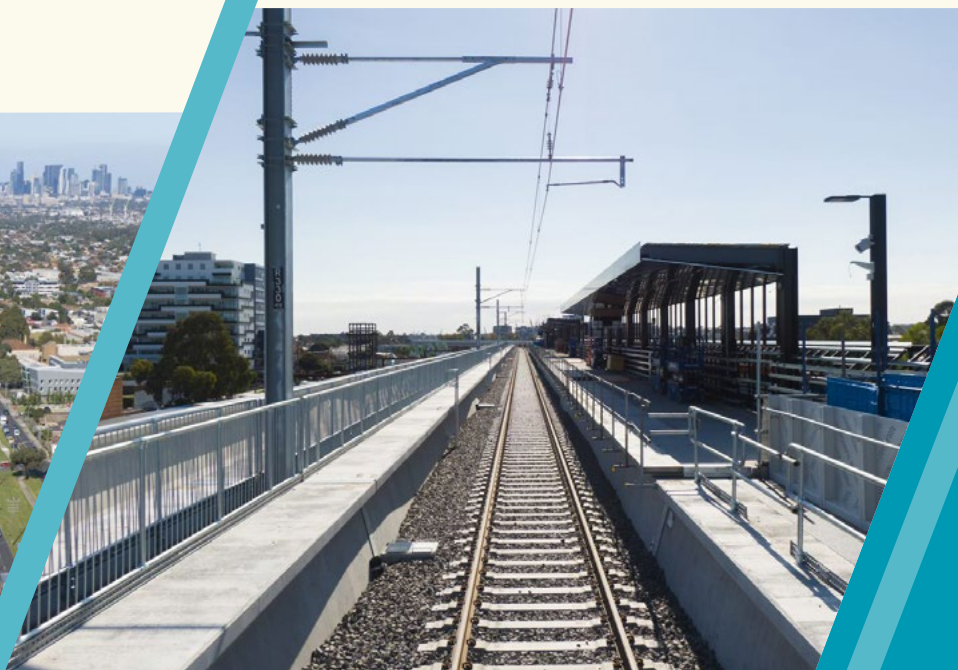
Platform one at Bell Station