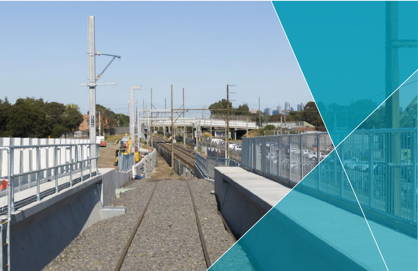
Rail bridge descent at Miller Street