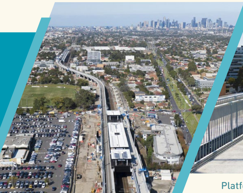
View of Preston Station from above