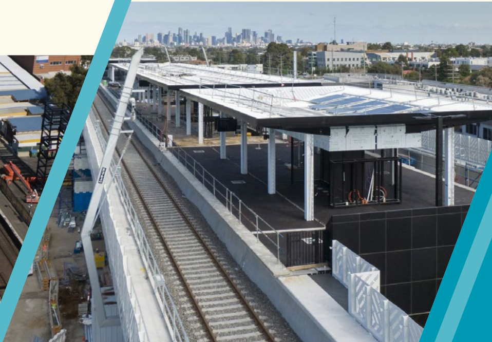
Preston Station platform