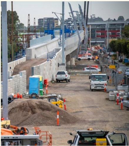
Rail bridge works – looking north from Miller Street

We will also continue to work on the Mernda-bound rail bridge and the new stations at Bell and Preston. When these works conclude, trains will travel on the completed rail bridge while the team continues work on the second bridge. Train passengers will have a good view of the works through winter when the Mernda line travels on a single track between Regent and Thornbury.