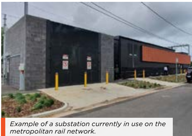
Example of a substation currently in use on the metropolitan rail network.

A substation is a mostly self-contained, unstaffed building housing electrical equipment that converts the local power supply into the voltage needed to operate trains, signals, and communication equipment across the train network.