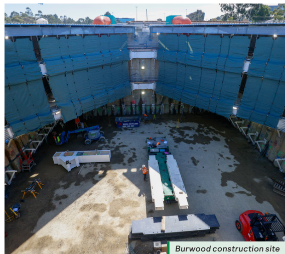
Burwood construction site