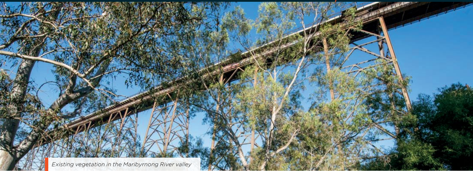
Existing vegetation in the Maribyrnong River valley

Melbourne Airport Rail will provide a greener way to travel to Melbourne Airport and deliver improved urban design and landscaping that will reflect and enhance the local area.