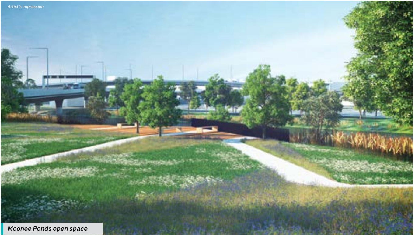
Moonee Ponds open space