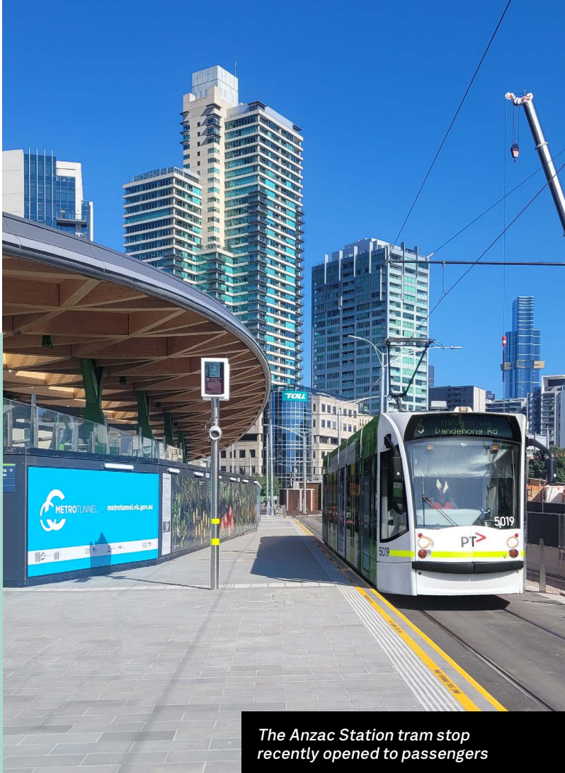
The Anzac Station tram stop recently opened to passengers

Work is underway for the future of St Kilda Road, with major changes to the way you travel.