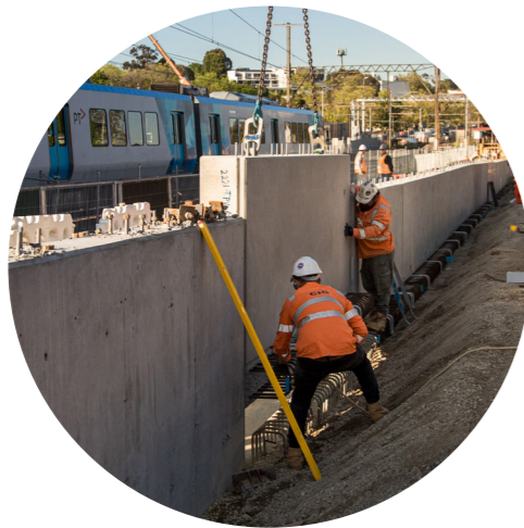
Road barrier being constructed on Beresford Street.

For details and to plan your journey, visit ptv.vic.gov.au