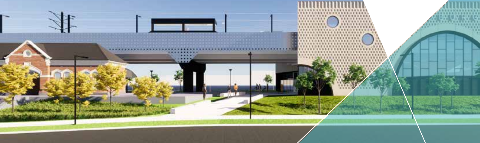
Coburg Station eastern view. Artist impression only. Subject to change.