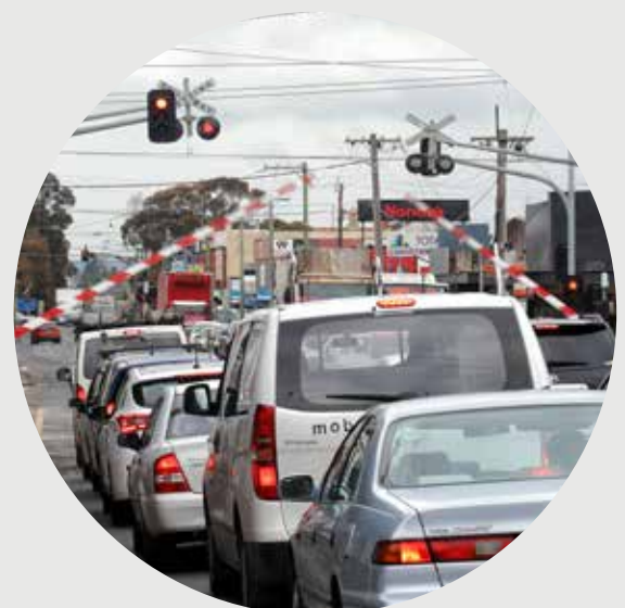
Banishing booms on Bell Street.

As we remove these level crossings on the Upfield line over the coming months, the project team has worked hard to keep Bell Street open to traffic for most of the works, only closing the road for short periods at night and on weekends.