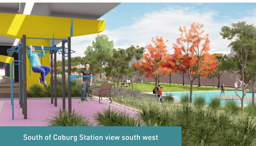
South of Coburg Station view south west

Under the elevated rail near Coburg Station, fitness equipment and a bench will be surrounded by native trees and shrubs and accessed by either the walking or cycling path.