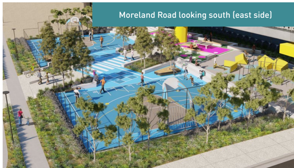
Moreland Road looking south (east side)

A skating area, climbing frame and parkour area will feature under the rail bridge. There will be seating, two table tennis tables and a drinking fountain.