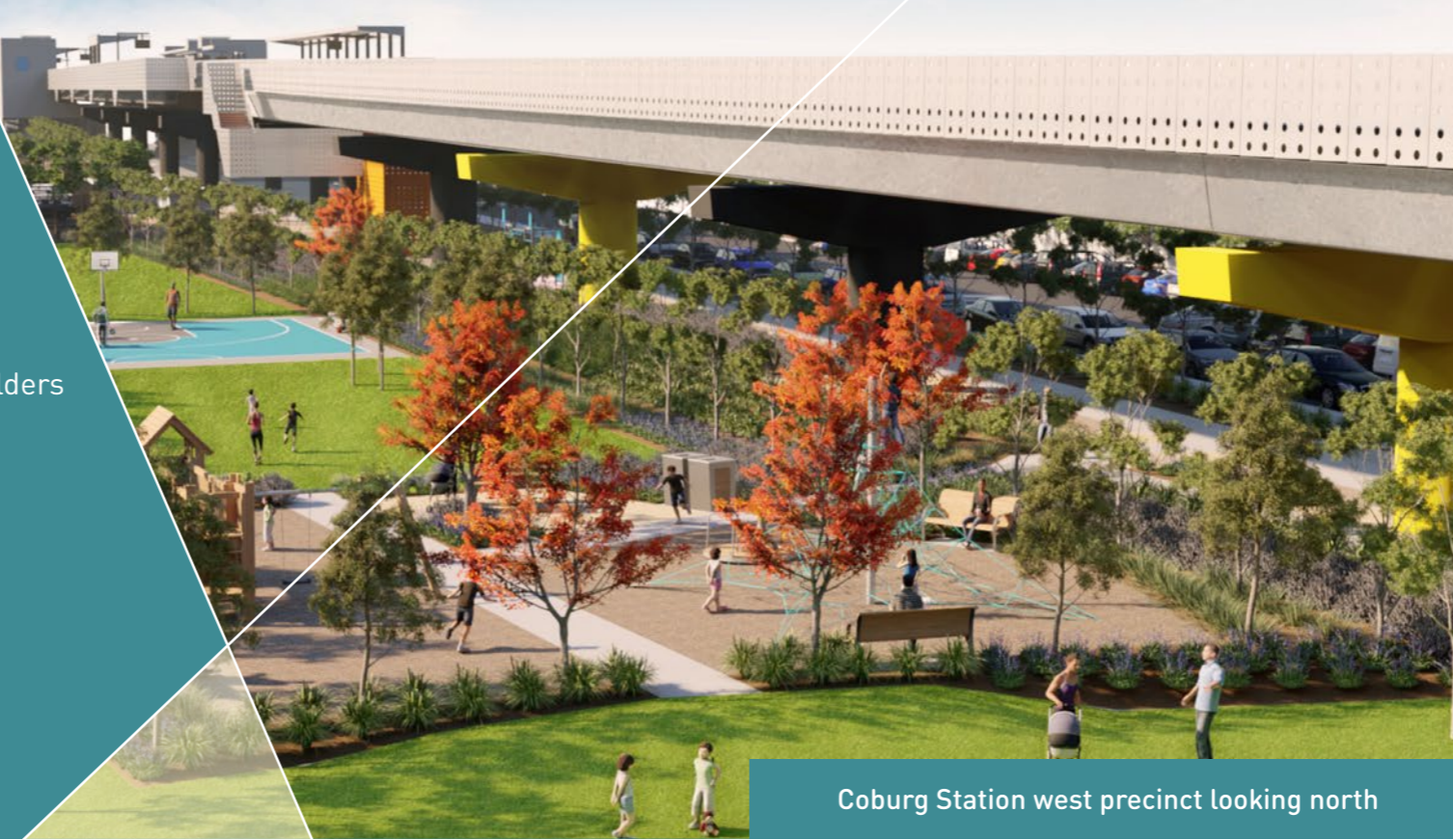
Coburg Station west precinct looking north

Check out the final open space designs out below: