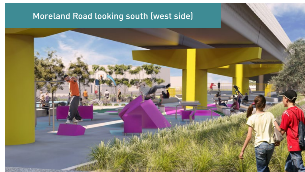
Moreland Road looking south (west side)

Under the elevated rail near Coburg Station, fitness equipment and a bench will be surrounded by native trees and shrubs and accessed by either the walking or cycling path.