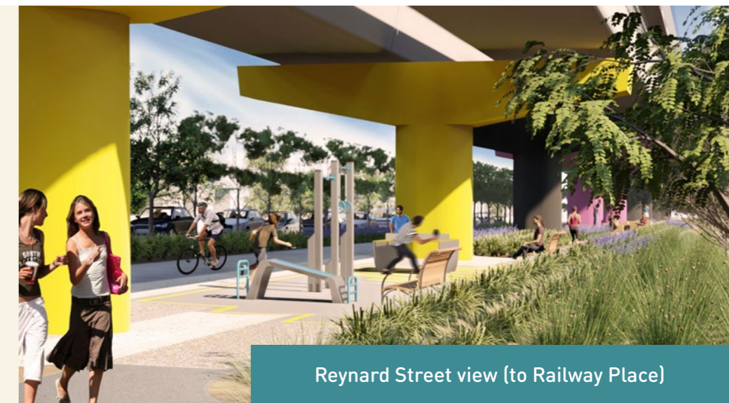
Reynard Street view (to Railway Place)

Looking from the corner of Reynard Street and Railway Place, this section of open space will contain exercise equipment, table tennis table, seating and the separated cycling and walking paths.