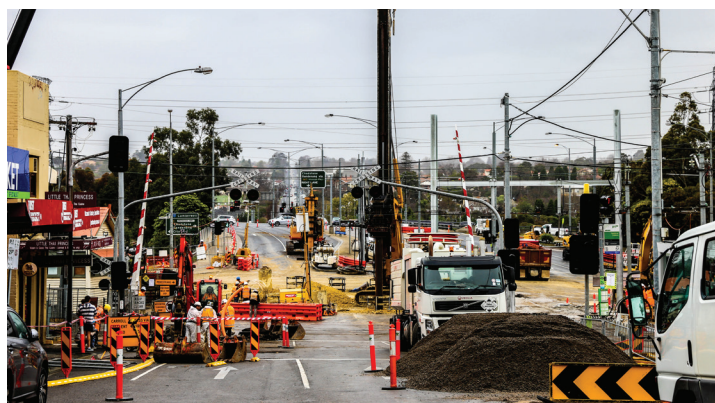
Installation of bridge foundations on Burke Road