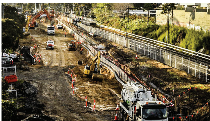
Construction along the Rail Corridor

At Burke Road, the Alliance is removing the level crossing by lowering the rail line under Burke Road, rebuilding Gardiner Station, as well as improvements to road and public transport connections.