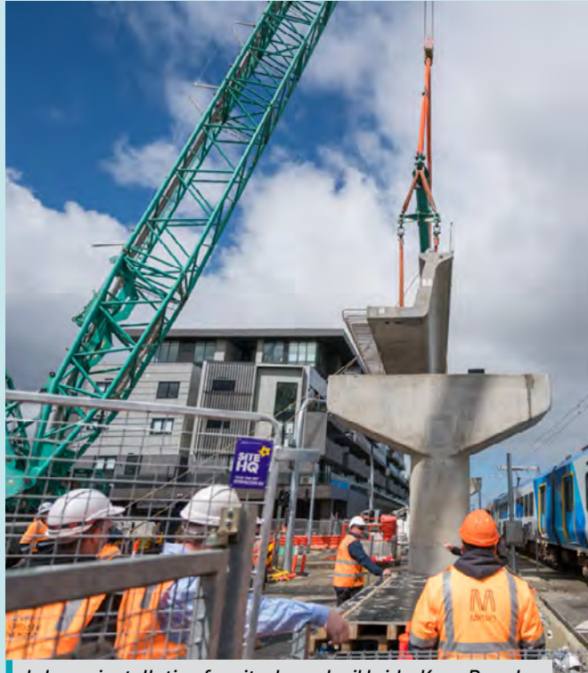
L-beam installation for city-bound rail bride, Keon Parade