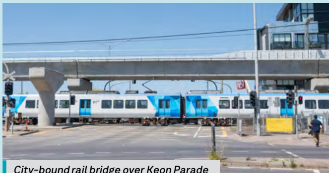
City-bound rail bridge over Keon Parade