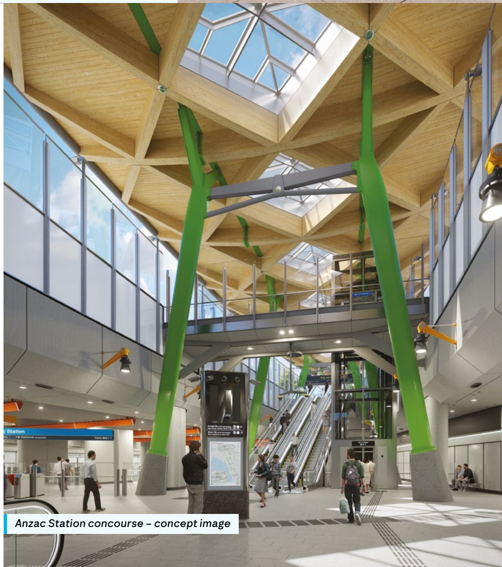
Anzac Station concourse – concept image

Anzac Station will have Victorian-first platform screen doors for better safety, climate control and less noise.