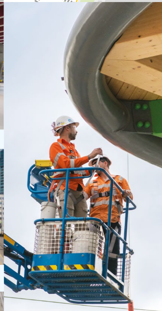
Anzac Station canopy under construction

Lifts will take people from entrances at Albert Road, the Shrine of Remembrance Reserve and the tram platform to the train platforms below ground.