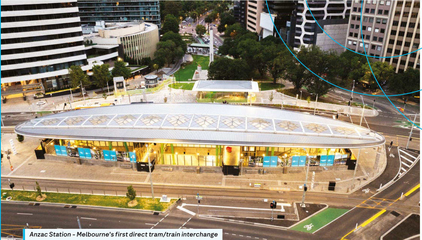
Anzac Station - Melbourne's first direct tram/train interchange

The Metro Tunnel will run the busy Cranbourne, Pakenham and Sunbury lines through a new tunnel under Melbourne's CBD, with bigger and more modern trains and next generation signalling for turn up and go services.