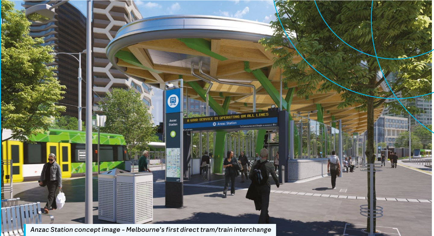
Anzac Station concept image – Melbourne's first direct tram/train interchange

The Metro Tunnel will run the busy Cranbourne, Pakenham and Sunbury lines through a new tunnel under Melbourne's CBD, with bigger and more modern trains and next generation signalling for turn up and go services.