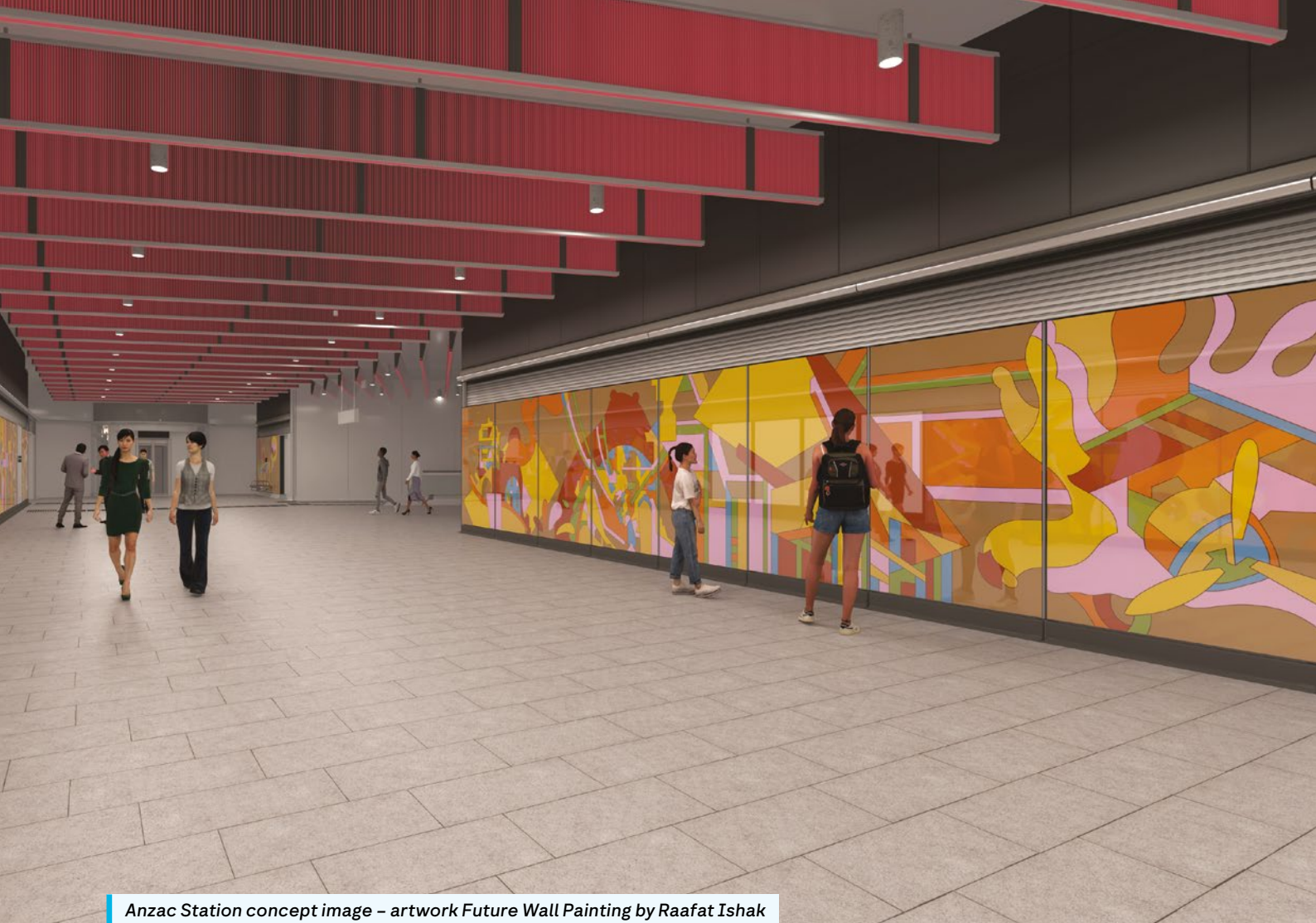
Anzac Station concept image – artwork Future Wall Painting by Raafat Ishak