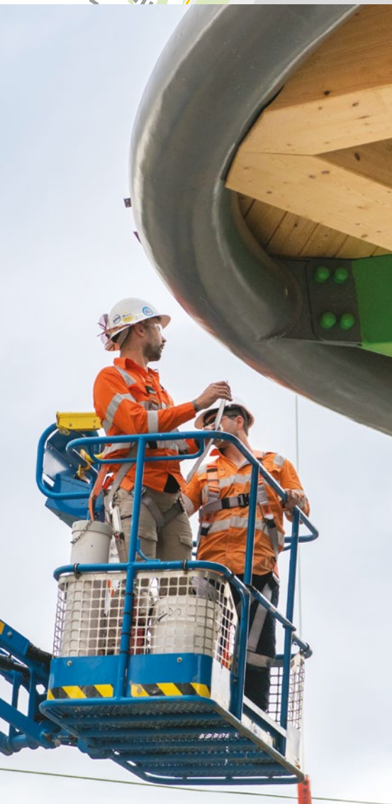
Anzac Station canopy under construction

Lifts will take people directly from entrances at Albert Road, the Shrine of Remembrance Reserve and the tram platform to the train platforms below ground.