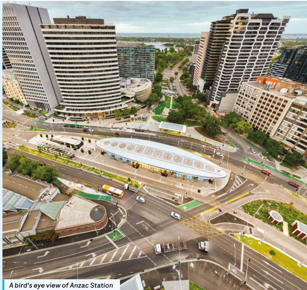
A bird's eye view of Anzac Station

Next-generation High Capacity Signalling for turn up and go services