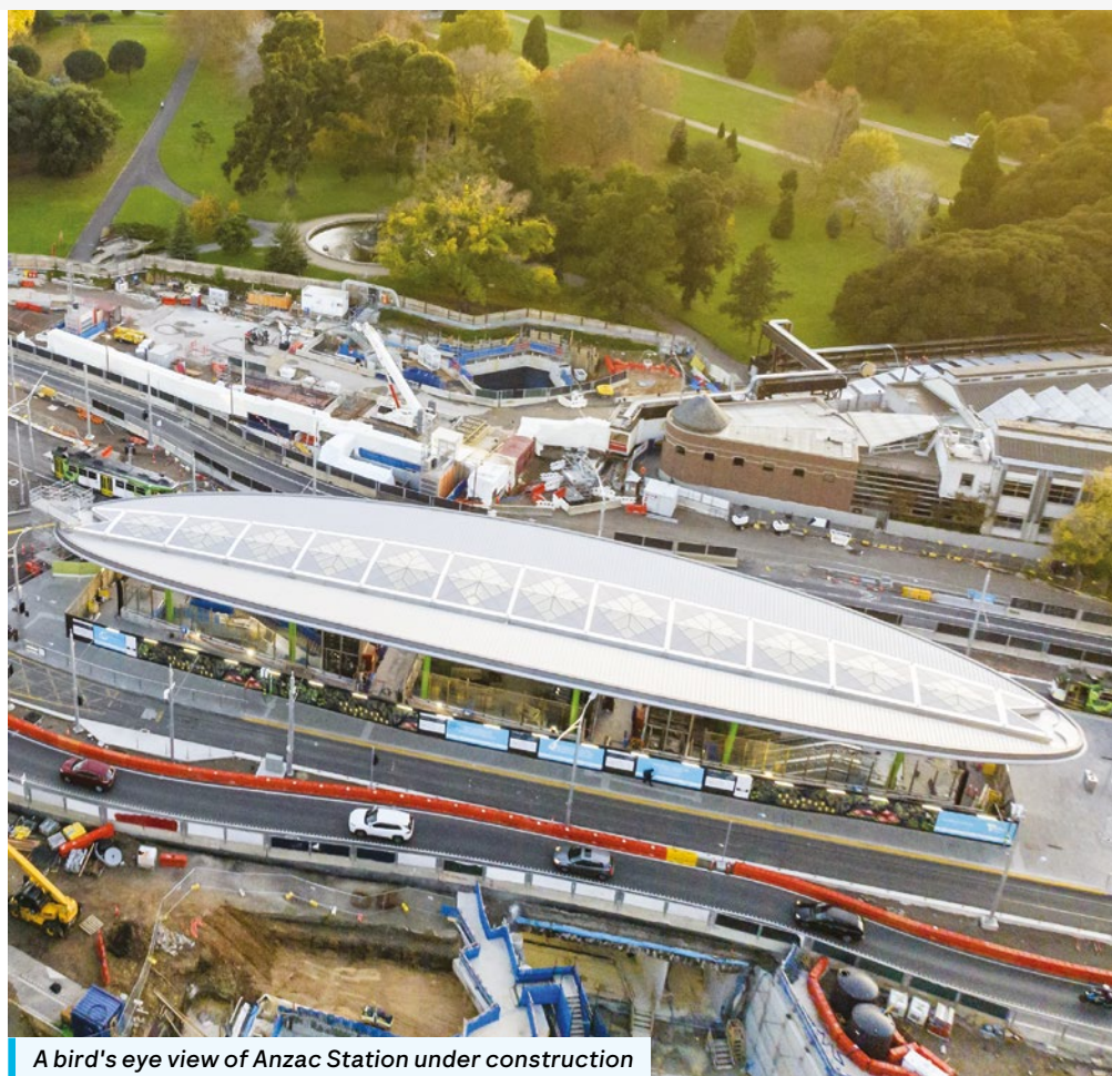
A bird's eye view of Anzac Station under construction

Next-generation High Capacity Signalling for turn up and go services