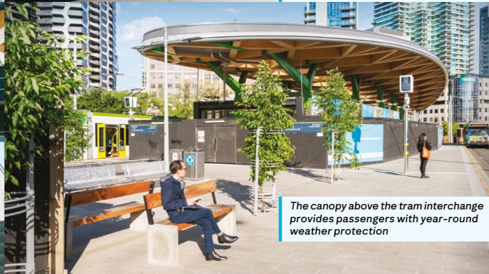
The canopy above the tram interchange provides passengers with year-round weather protection