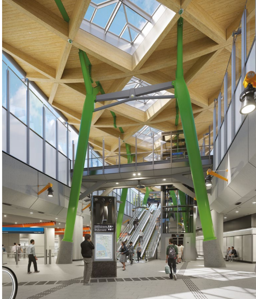
Anzac Station concept image – concourse

Anzac Station will have Victorian-first platform screen doors for better safety, climate control and less noise.