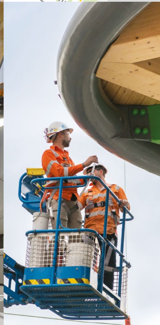
Anzac Station canopy under construction

Lifts will take people directly from entrances at Albert Road, the Shrine of Remembrance Reserve and the tram platform to the train platforms below ground.