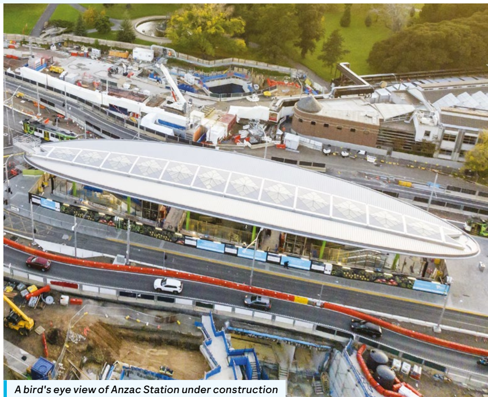
A bird's eye view of Anzac Station under construction

Next-generation High Capacity Signalling for turn up and go services