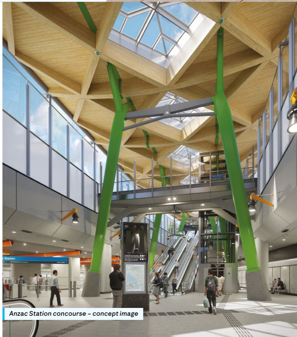
Anzac Station concourse – concept image

Anzac Station will have Victorian-first platform screen doors for better safety, climate control and less noise.