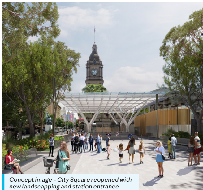
Concept image - City Square reopened with new landscaping and station entrance

24 hour works are sometimes required during peak construction activities