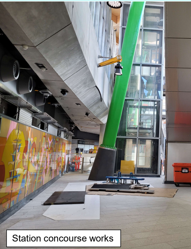
Station concourse works