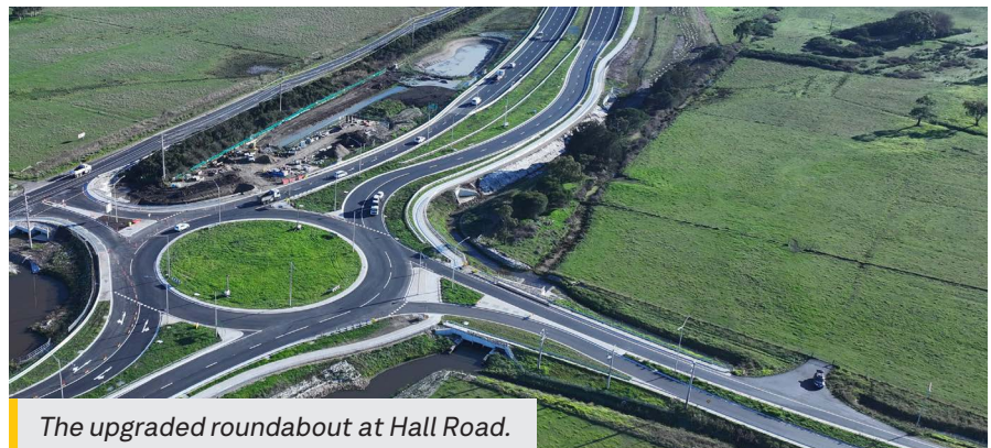
The upgraded roundabout at Hall Road.

Find out more about the projects and disruptions in your area at bigbuild.vic.gov.au/pakenham