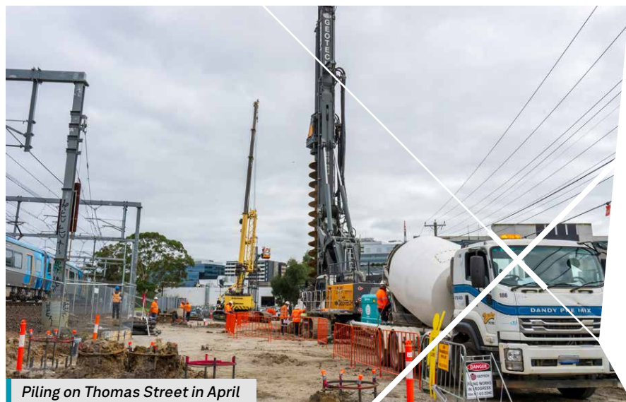
Piling on Thomas Street in April

* Impacted properties will be directly notified