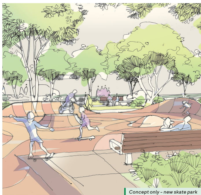
Concept only - new skate park

Further details on the requirements for the new permanent open space are available in the SRL East Public Open Space Framework.