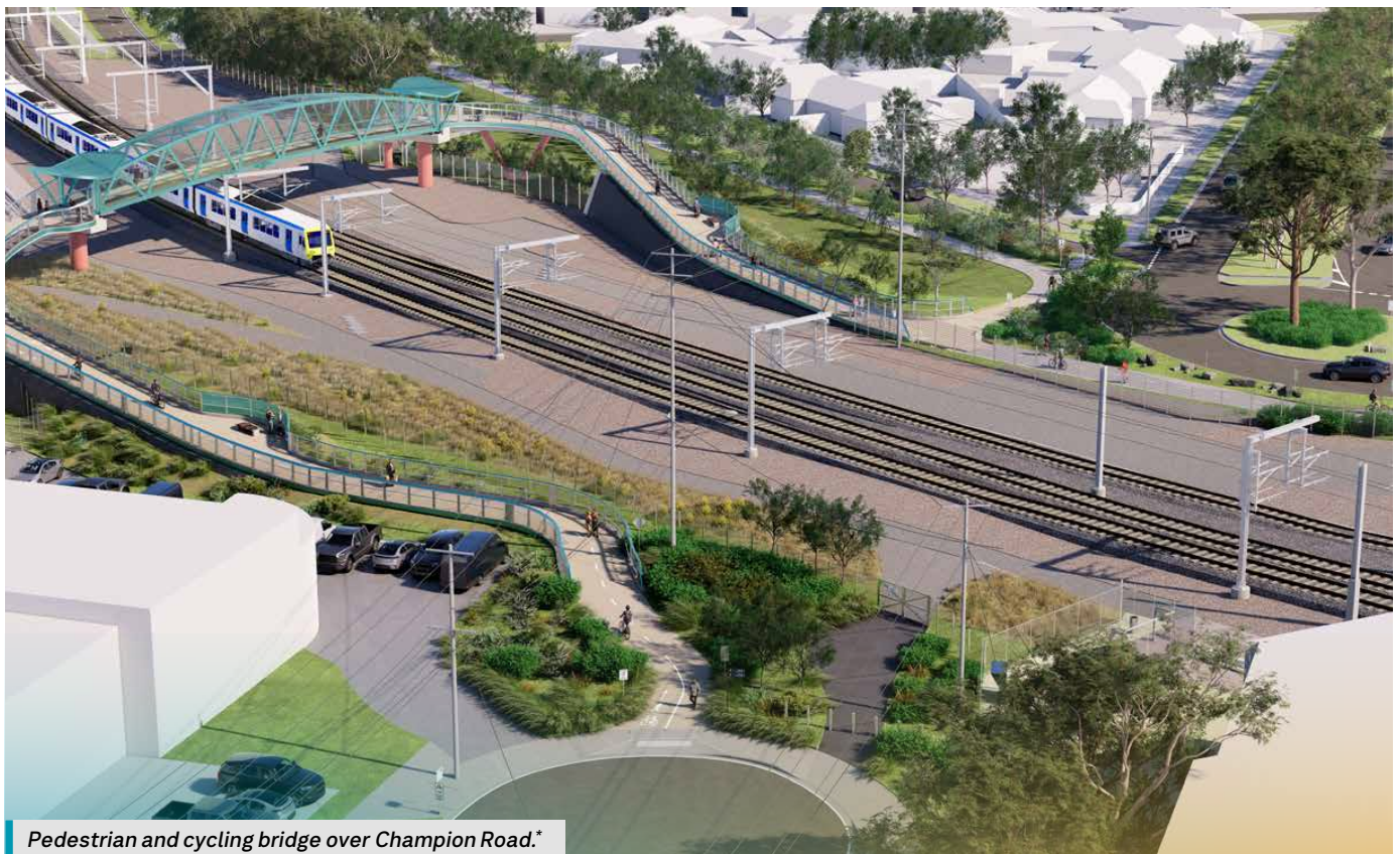
Pedestrian and cycling bridge over Champion Road.*

*Vegetation shown at 10 years maturity. Artist impression only. Subject to change.