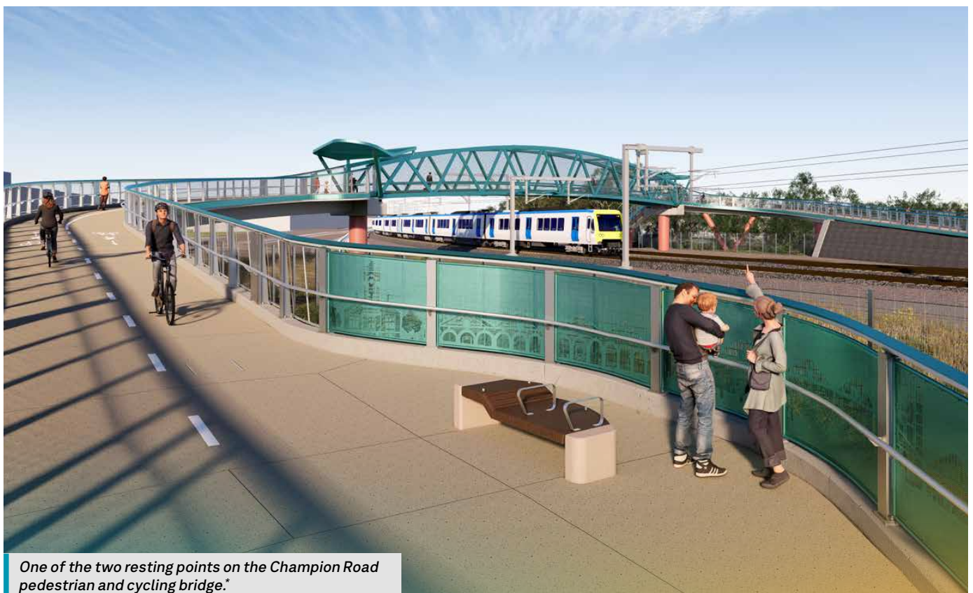
One of the two resting points on the Champion Road pedestrian and cycling bridge.*