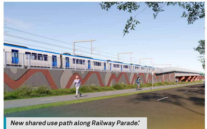
New shared use path along Railway Parade.*

The new Akuna Drive link road connecting Champion Road to Maddox Road will service local businesses and the community. We will deliver new car parking on both sides of the new link road, which will contribute to more overall car parking in the local area.