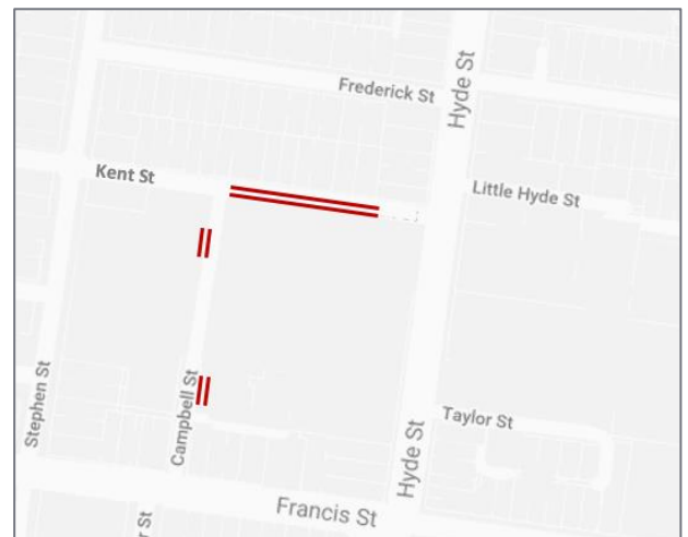
The red area shows the approximate location for the Kent Street and Campbell Street recharge well works from mid-June.