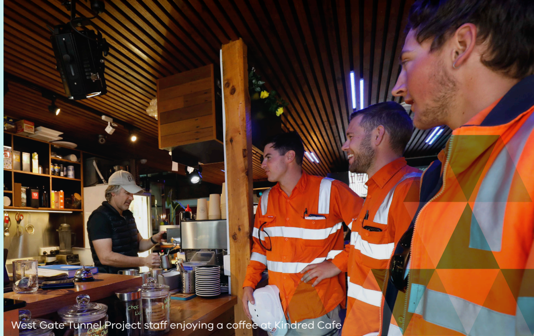
West Gate Tunnel Project staff enjoying a coffee at Kindred Cafe

The relocation of the North Yarra Main Sewer on Whitehall Street in Footscray/ Yarraville will see traffic detours in the area for 12 months.