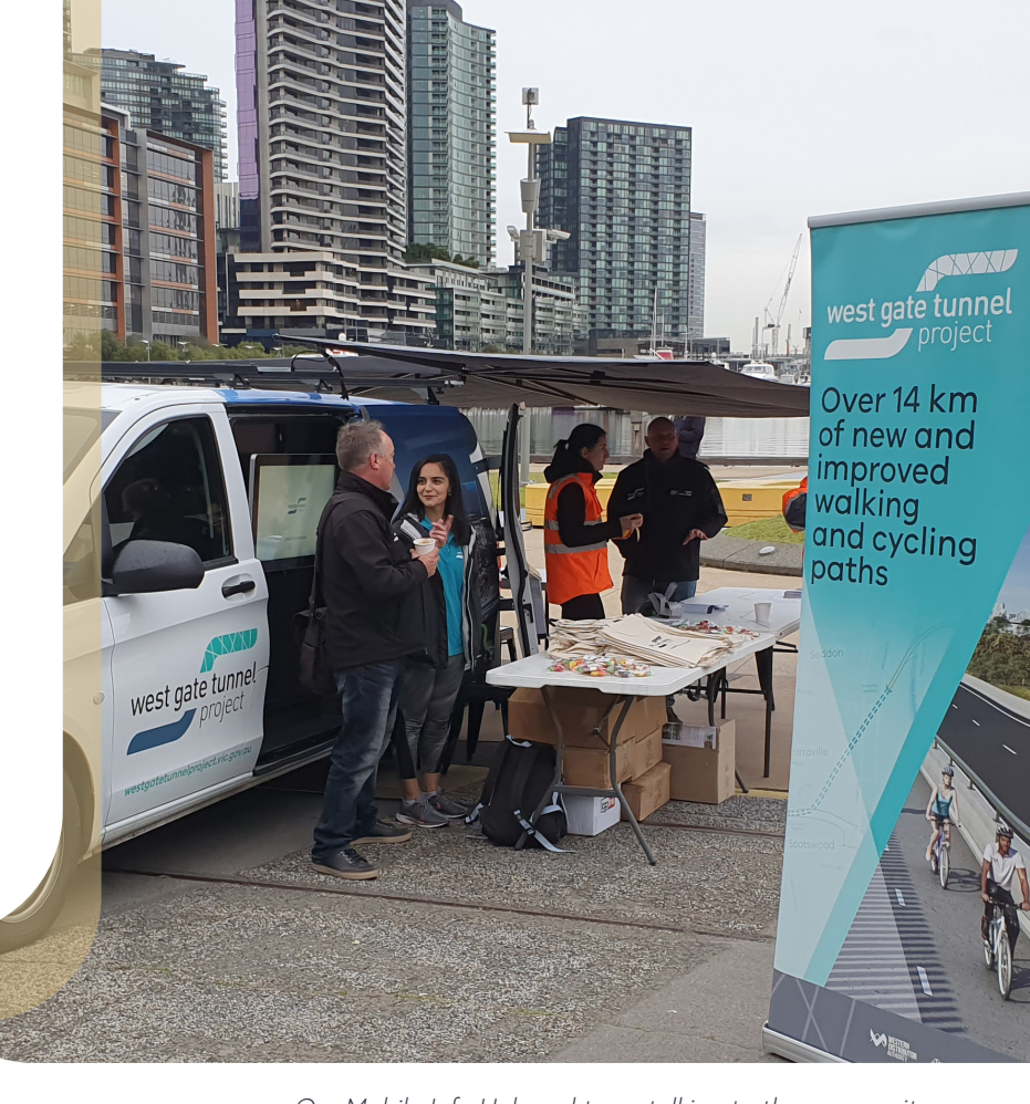
Our Mobile Info Hub and team talking to the community

For Info Centre Christmas and New Year opening times visit westgatetunnelproject.vic. gov.au/contact/information-centre