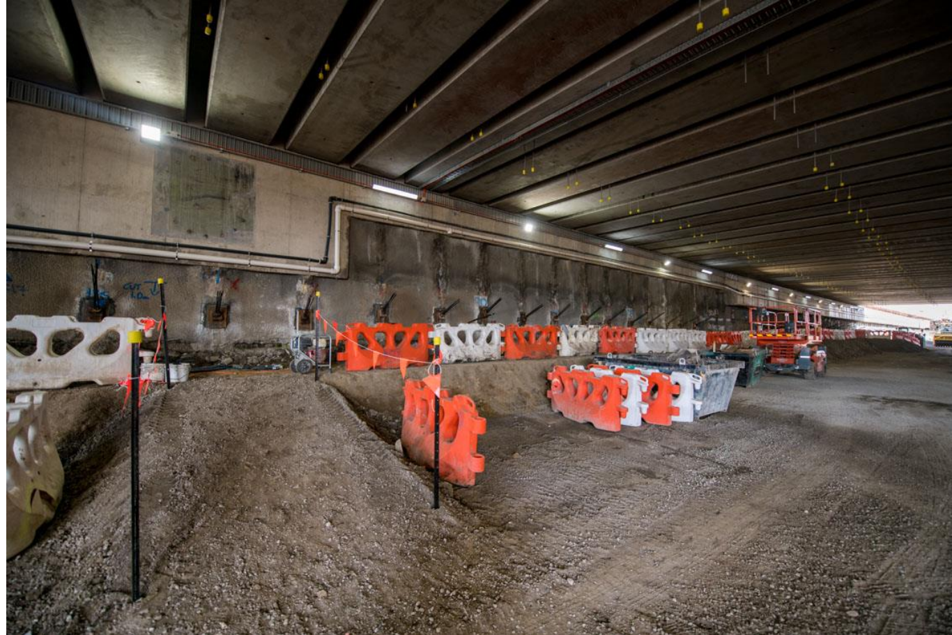
Ongoing excavation and roof deck installation on city bound tunnel entrance