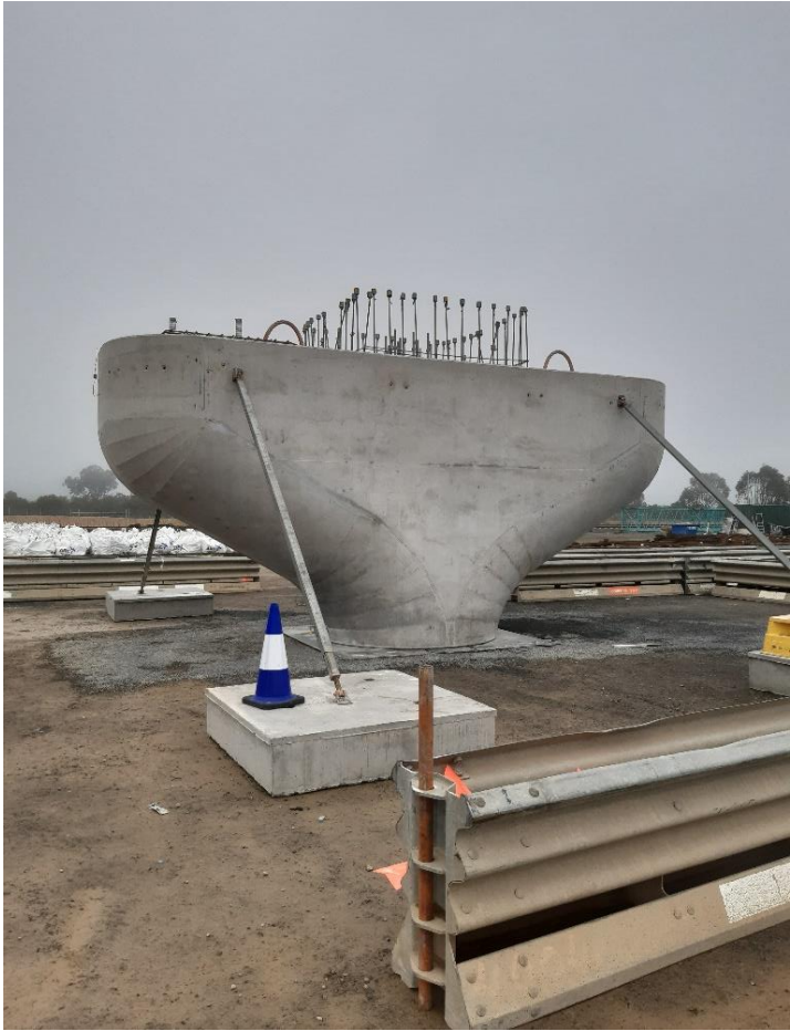
Crosshead ready for delivery