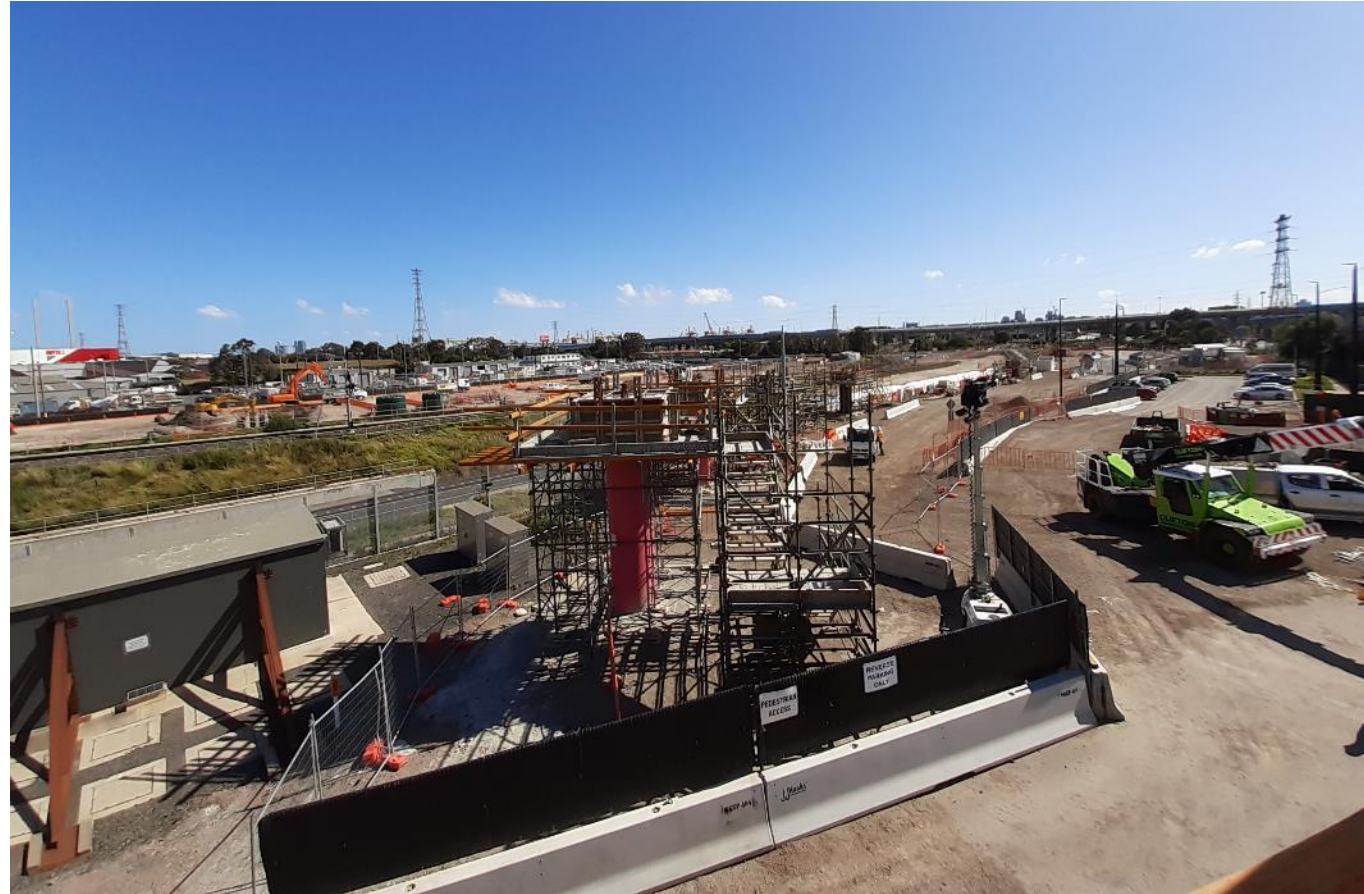
Pier construction works – Dynon Road shared use path