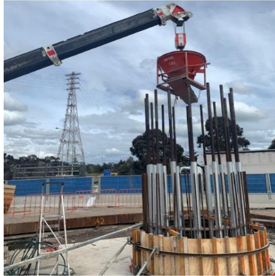
Insitu column work for CityLink off-ramp on to Footscray Road