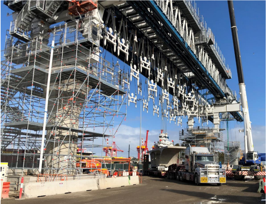
Commissioning of the Launching Gantry