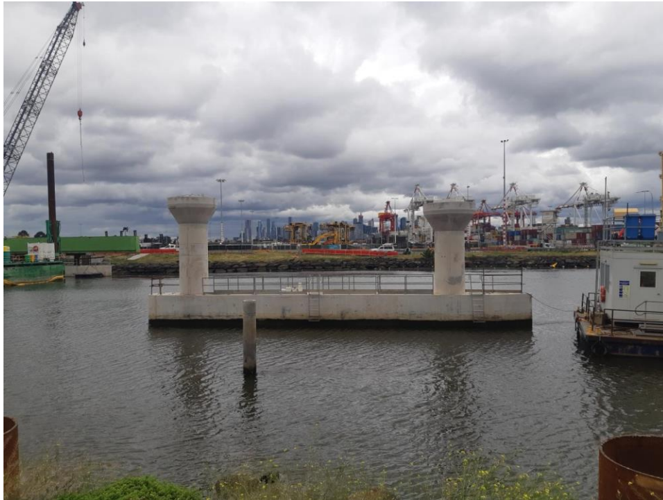
Maribyrnong River bridge column and tiebeam