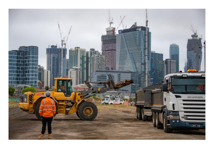
Appleton Dock Bored Piling