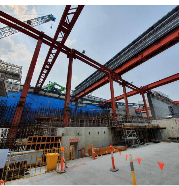
Maintenance level road deck