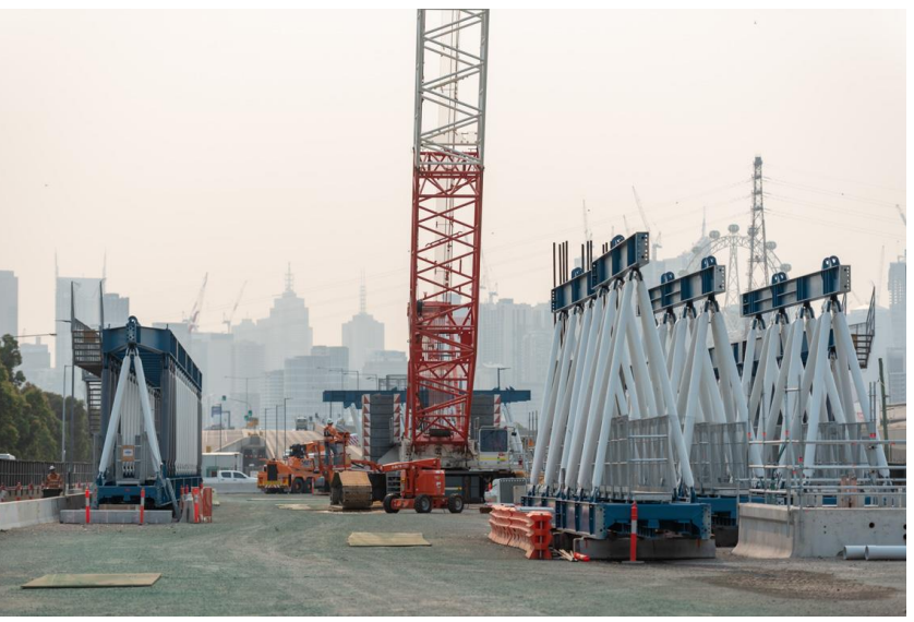
The launching gantry being assembled on Footscray Road