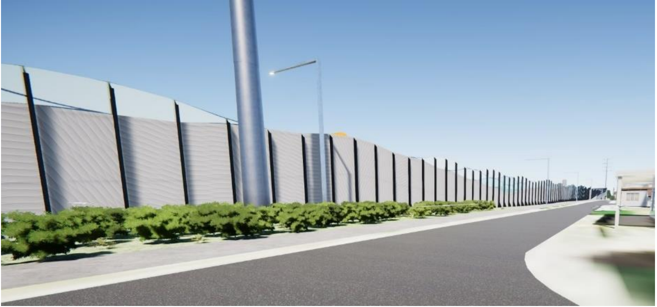
Indicative image of noise walls at the intersection of Fogarty Avenue and Highgate Street looking west