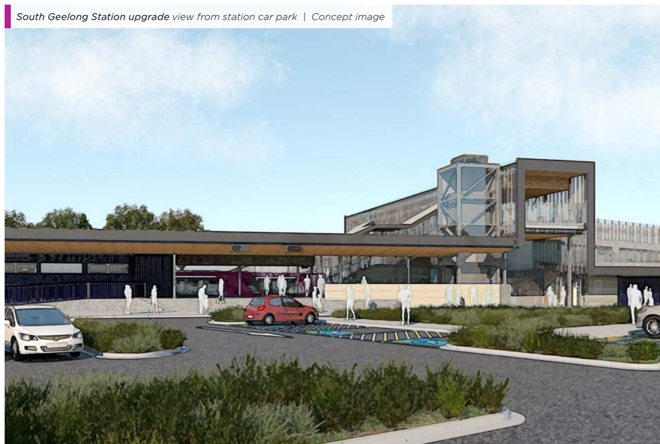
South Geelong Station upgrade view from station car park | Concept image

The concept images for the station upgrades and level crossing removals give a sense of how the design might look. We will use community feedback and key design principles to develop creative treatments and enhance the surrounding landscape as part of the ongoing design development process for the project