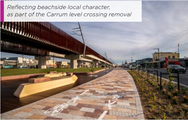
Reflecting beachside local character, as part of the Carrum level crossing removal