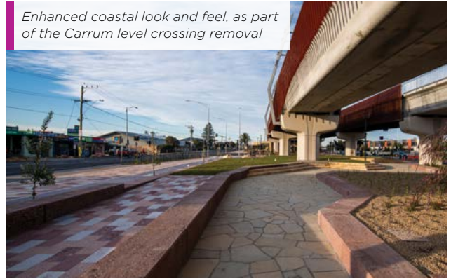
Enhanced coastal look and feel, as part of the Carrum level crossing removal