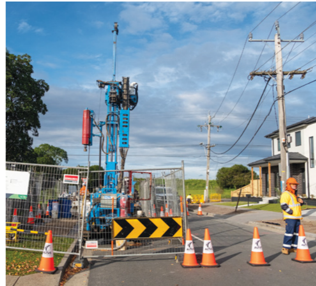
SRL East site investigations at Clayton