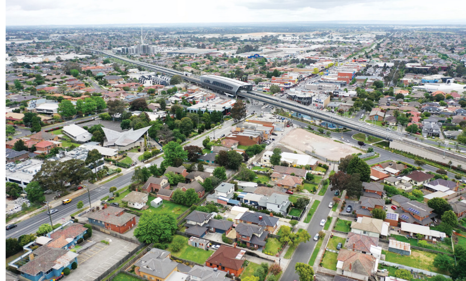
Aerial image of SRL East station precinct at Clayton