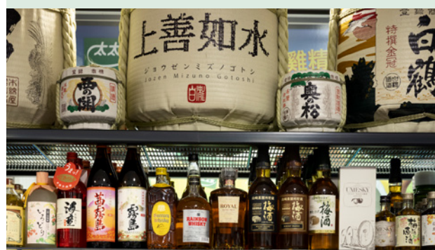
Specialty food store in Clayton

Your feedback is important to planning and developing Suburban Rail Loop and will contribute to making areas around SRL East stations even better places to live, work and visit.