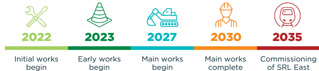
Figure 2: Clayton construction timeframe

Disruption at surface level is expected to be shorter than the overall construction time.