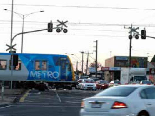
Keon Parade, Keon Park