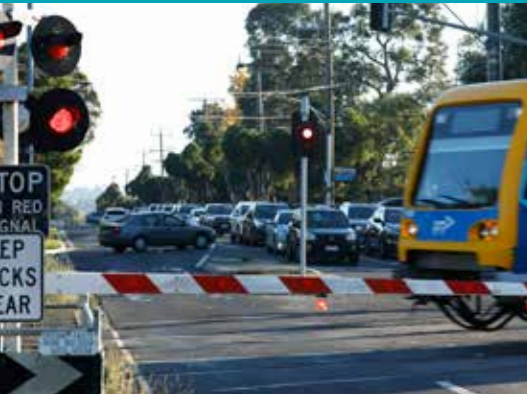
Dublin Road, Ringwood East