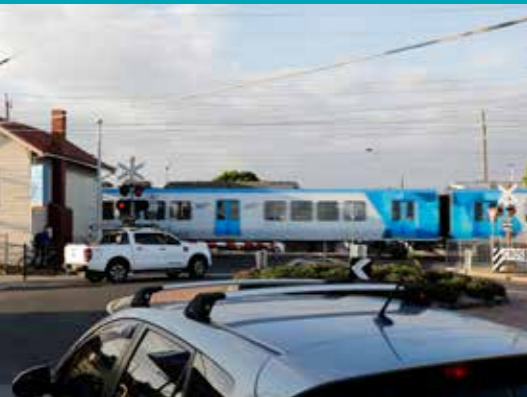
Parkers Road, Parkdale