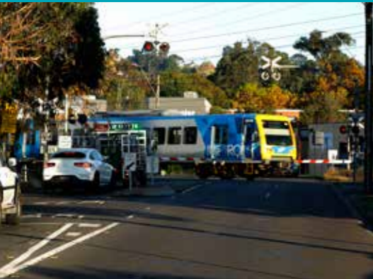
Coolstore Road, Croydon