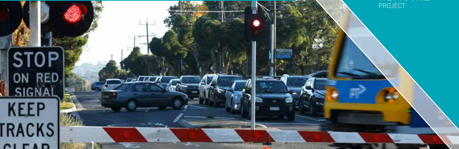
Congestion at Dublin Road, Ringwood East