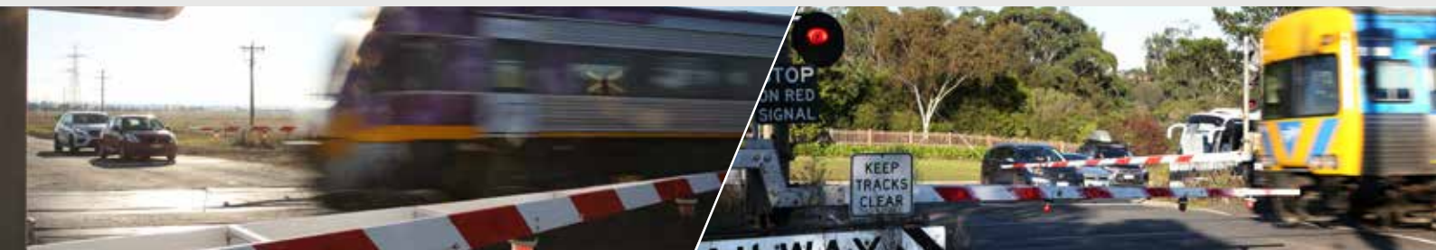
Calder Park Drive, Calder Park

Sign up for project updates by scanning the QR code or visit levelcrossings.vic.gov.au/subscribe