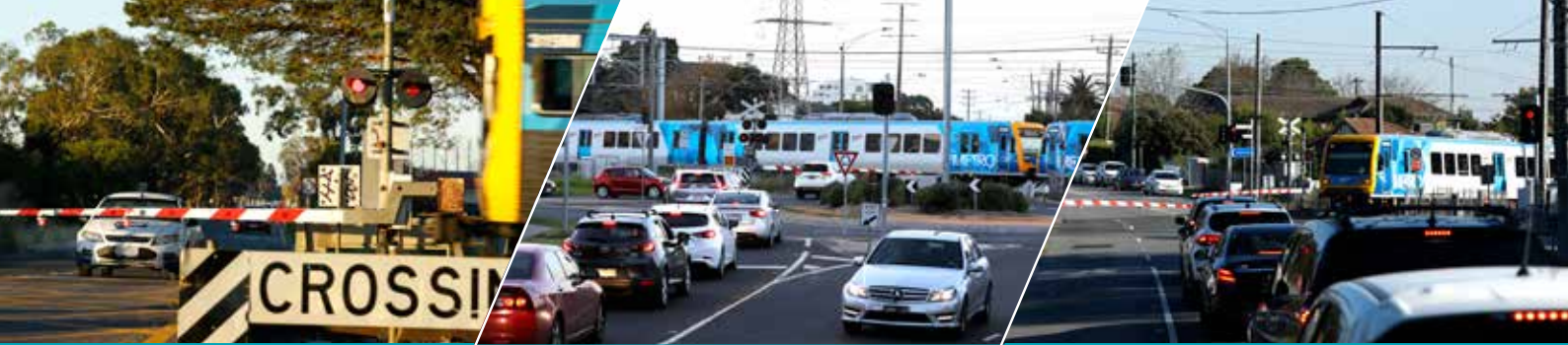
Brunt Road, Beaconsfield