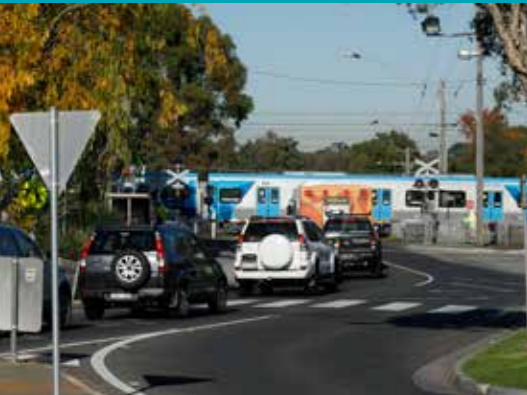
Webb Street, Narre Warren