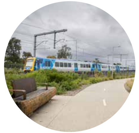
New Seaford walking and cycling path