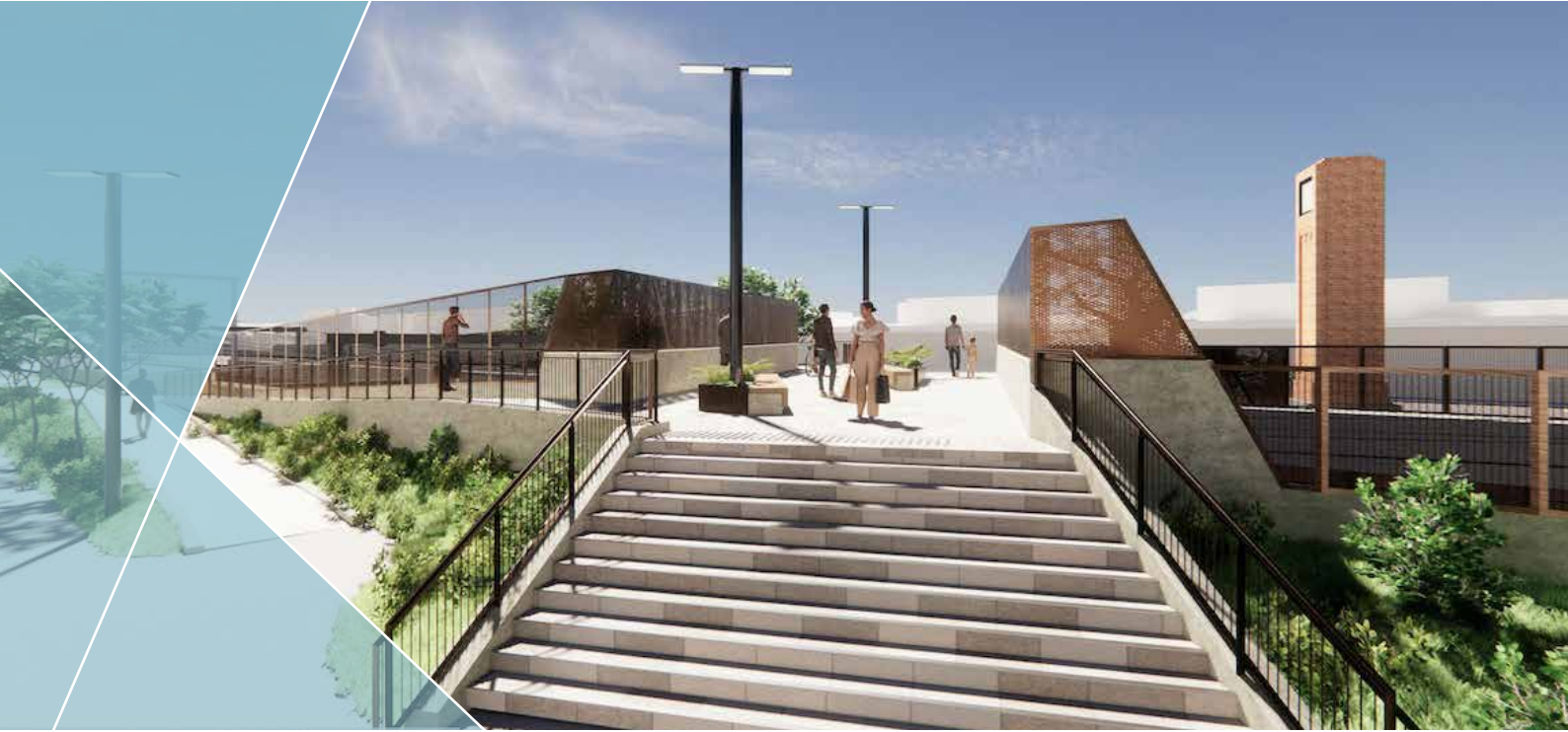
The new Chelsea pedestrian bridge. Artist's impression only, subject to change.

The Victorian Government is removing 18 level crossings and building 12 new stations as part of a $3 billion upgrade of the Frankston line that will improve safety, reduce congestion and allow more trains to run more often.