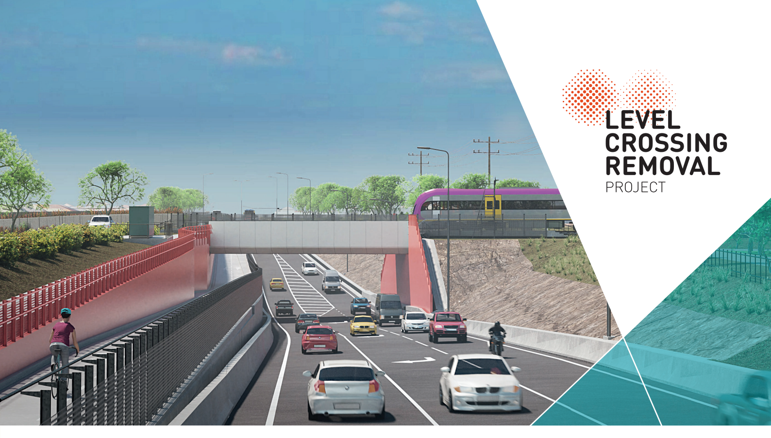
New shared use path on Robinsons Road looking south. Artist's impression. Subject to change.