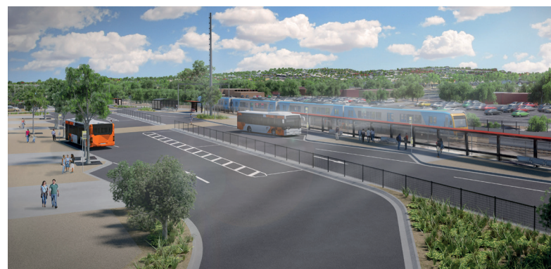
New Berwick Station bus interchange. Artist impression only