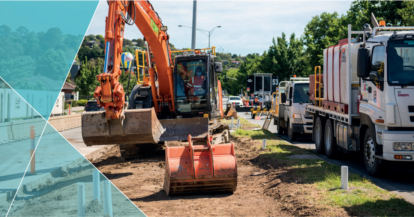
Road works along Clyde Road