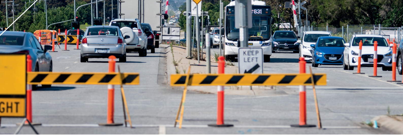
Road works at Gibb Street