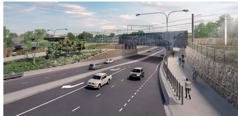
New Clyde Road underpass. Artist impression only

A new shared use path will be built along Clyde Road and more than 37,000 trees, plants and shrubs will be planted in the area.