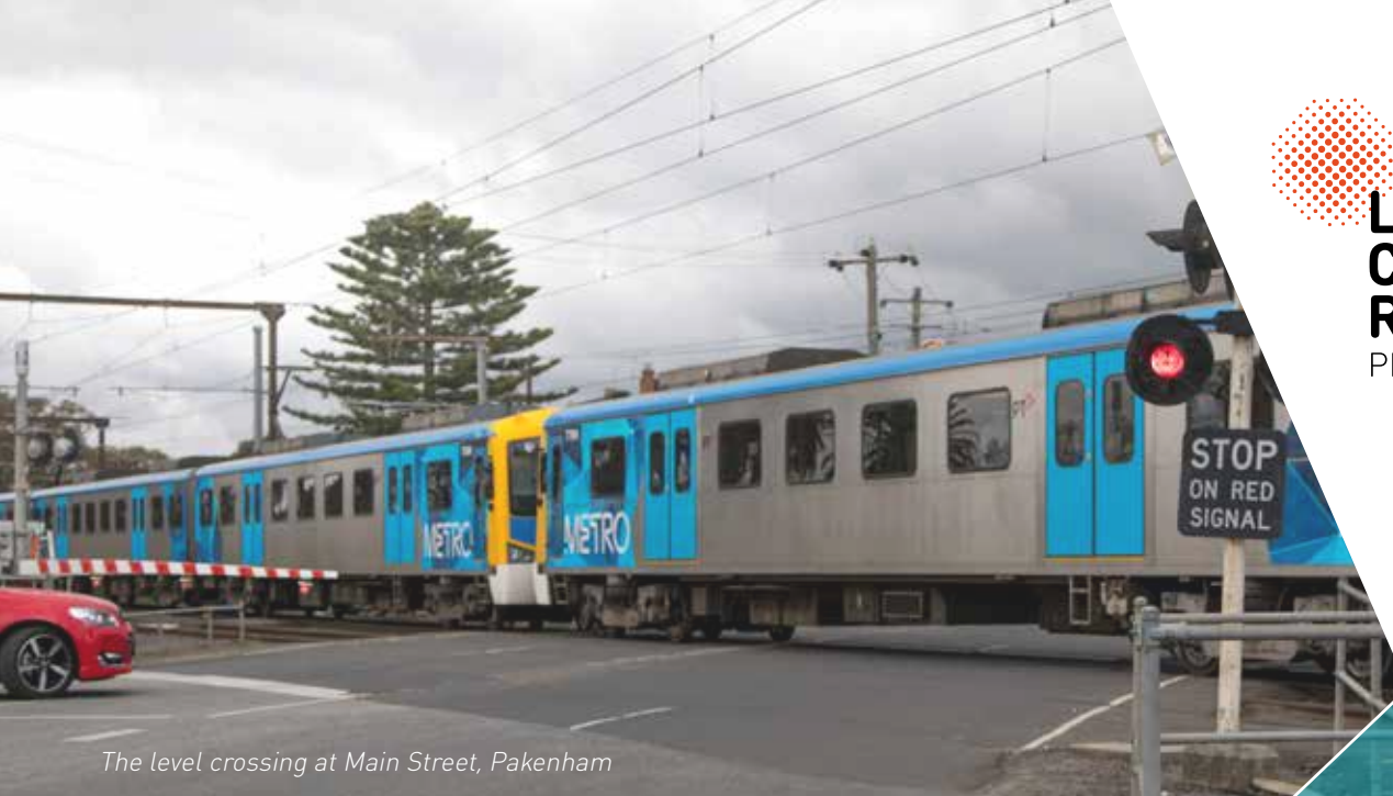
The level crossing at Main Street, Pakenham