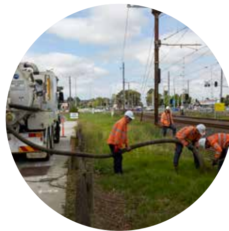
An example of the type of works you may see in the area

We'll be coming out to talk to the community soon and we'll be seeking your feedback on the project.