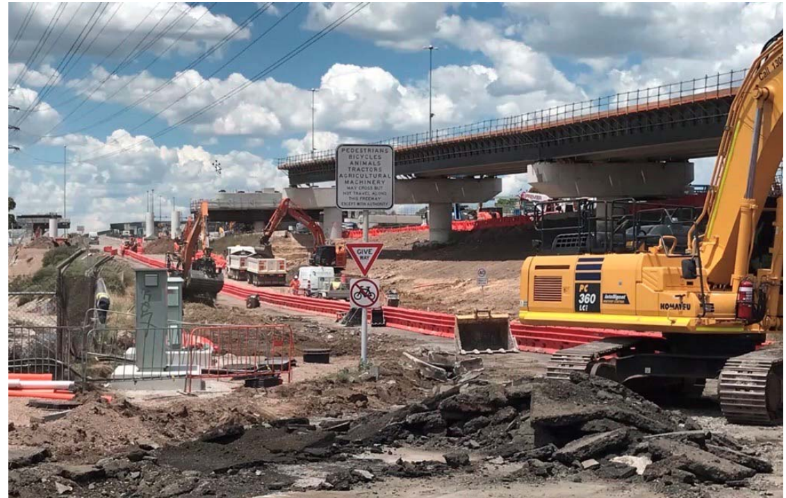
Excavation in progress on Williamstown Road inbound entry ramp