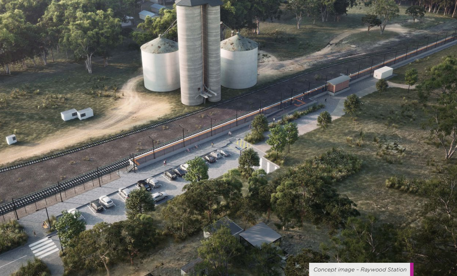
Concept image – Raywood Station