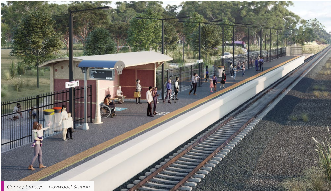
Concept image - Raywood Station

Lighting and CCTV will provide station users with added security.