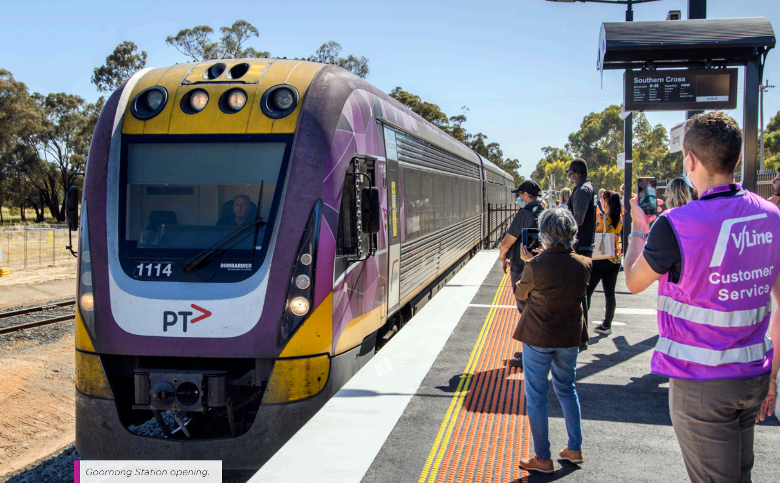
Goornong Station opening.