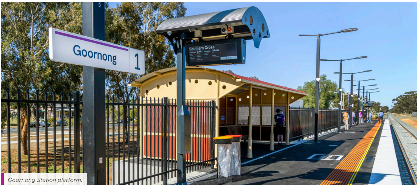
Goornong Station platform.

Lighting and CCTV provides station users with added security.