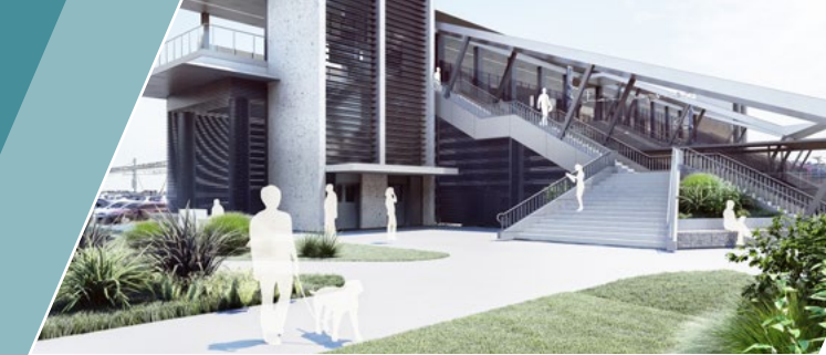
Artist impression of landscaping in southern plaza