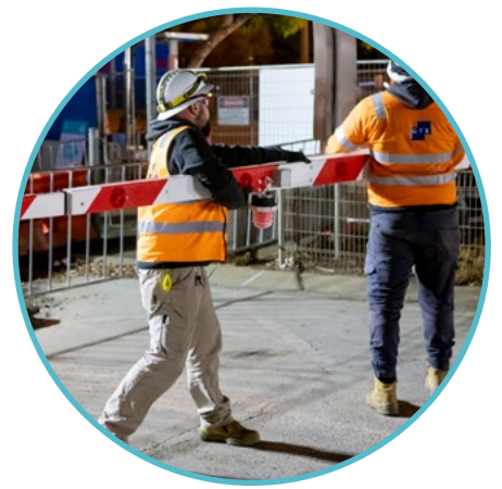
Workers carrying a boom gate away from site

We'll continue to put the finishing touches on the new community spaces and station connections until mid 2022.