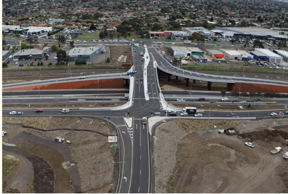
Road upgrades undertaken at Old Geelong Road, Heaths Road and Morris Road in Hoppers Crossing

Works are also beginning at Mt Derrimut Road in Deer Park, where the level crossing will be removed by raising the rail line above the road and a new Deer Park Station will be built.