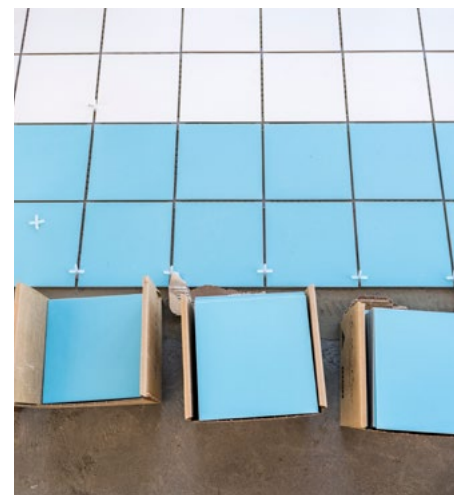
Installing TRACKwork public artwork tiles