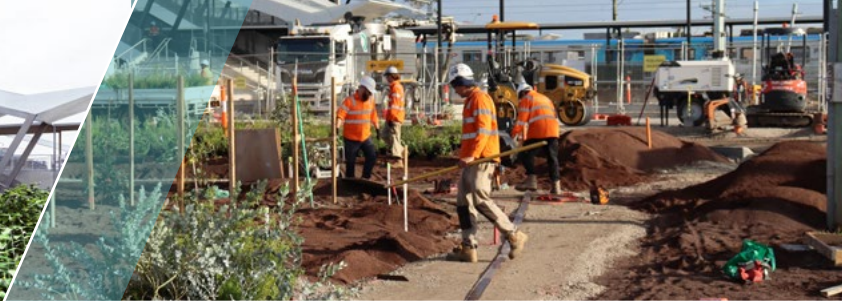
Planting underway in the southern plaza