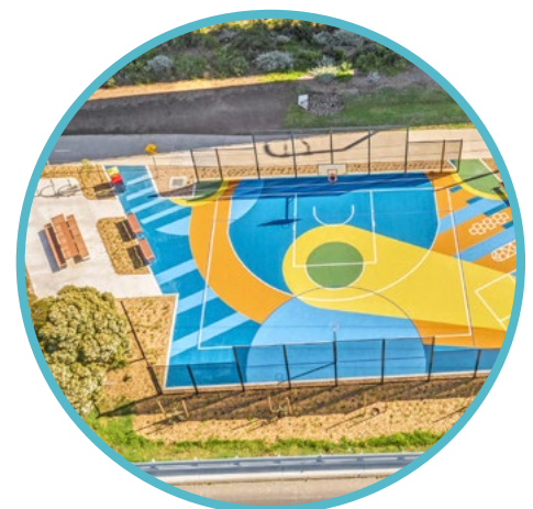
A view of the multipurpose space from above

Over 4000 shrubs and bushes and 24 trees planted