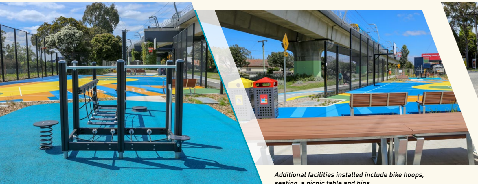
The innovative seniors exercise equipment complements other exercise stations along the Djerring Trail

We completed these spaces in four months.