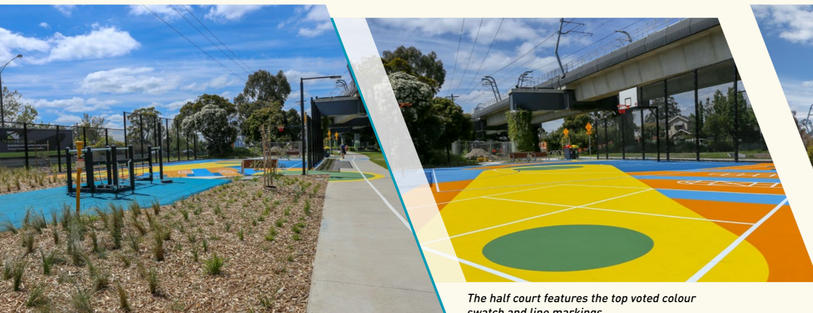
Natives plants and bushes were a popular request