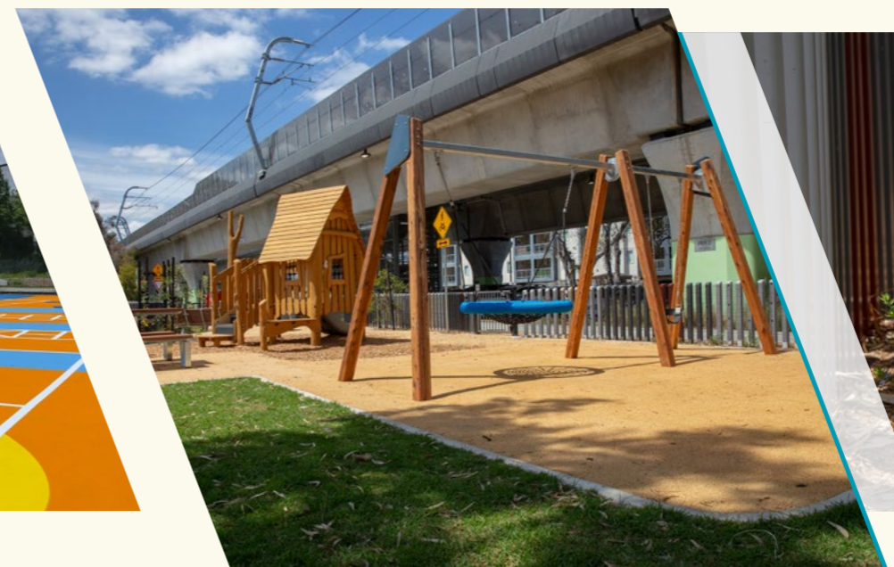
A swing set was the highest voted play equipment during consultation