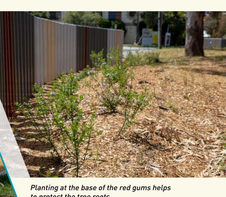
Planting at the base of the red gums helps to protect the tree roots