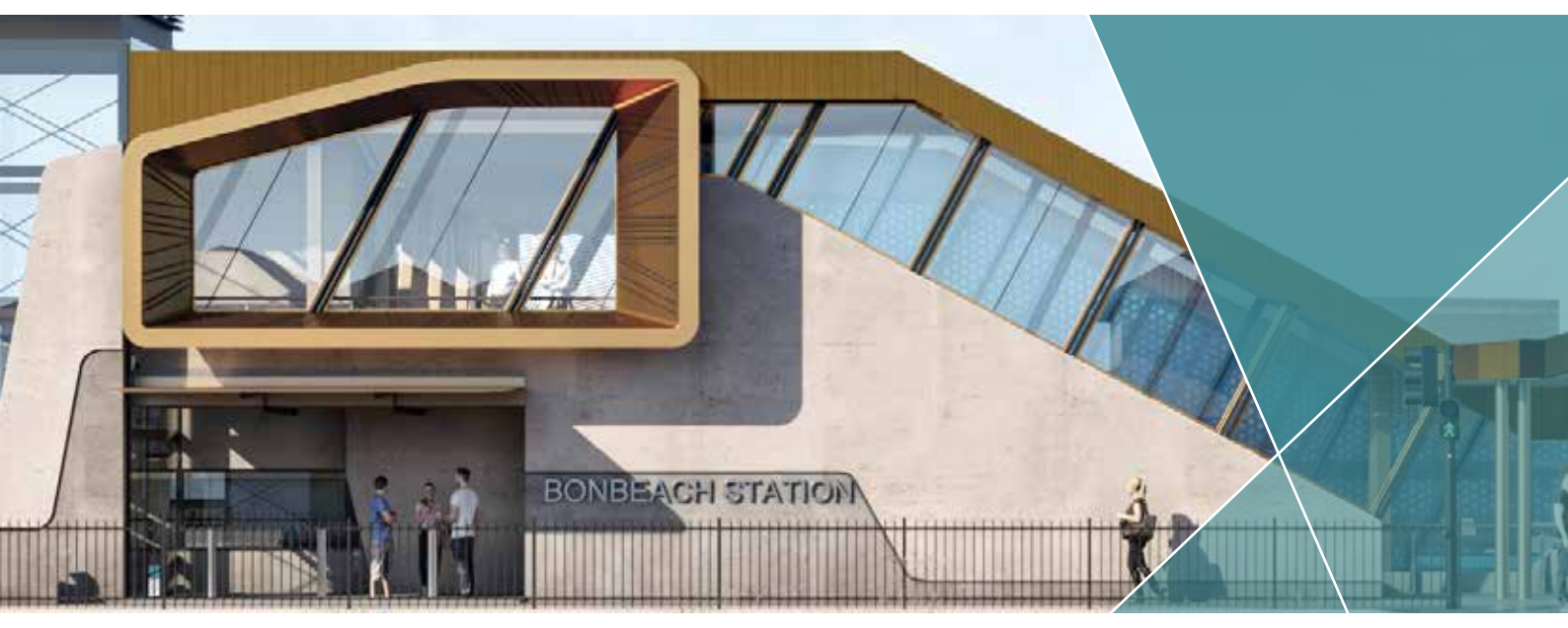
New Bonbeach Station entrance - artist's impression

The Level Crossing Removal Project is removing 18 level crossings and building 12 new stations as part of a $3 billion upgrade along the Frankston line that will improve safety, reduce congestion and allow more trains to run more often.